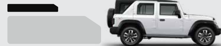
Everest White Black