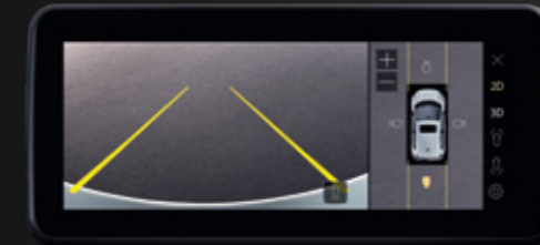
Rear 2D View