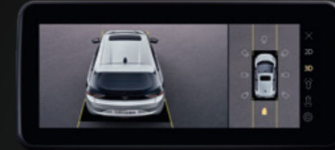
Rear 3D View