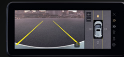
Front 2D View

Step into the future of convenience, where the tangle of cords is replaced by the simplicity of wireless power. Just place your phone and watch it come to life.