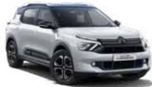
POLAR WHITE BODY WITH COSMO BLUE ROOF