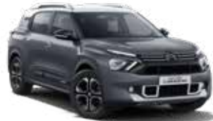
PLATINUM GREY BODY WITH POLAR WHITE ROOF