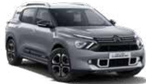
STEEL GREY BODY WITH POLAR WHITE ROOF