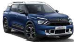
COSMO BLUE BODY WITH POLAR WHITE ROOF