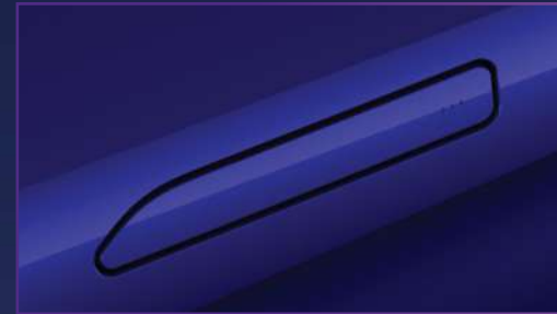
SMART DOOR HANDLES