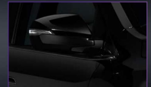
FIRST-IN-SEGMENT MEMORY ORVMs LINKED TO THE SEAT PROFILES