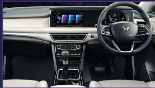
LUXURIOUS AND SOPHISTICATED INTERIORS

The Adrenox powered XUV700 is effortlessly impressive. From the style lines to the bold SUV stance, just one look is enough to get heads turning. Add the Skyroof™ and distinct LED cabin lights, and you've got an SUV that can't be ignored.