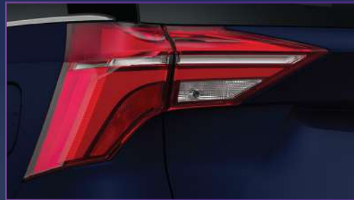
CAPTIVATING ARROW-HEAD LED TAILLAMPS