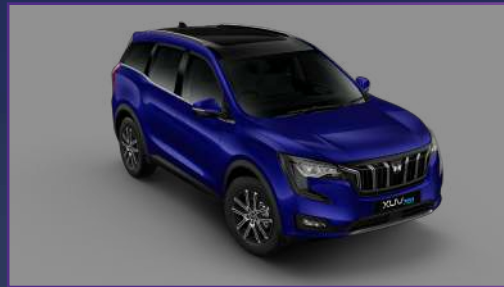
DUAL TONE BLACK ROOF