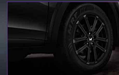
ALL-NEW BLACK ALLOY WHEELS