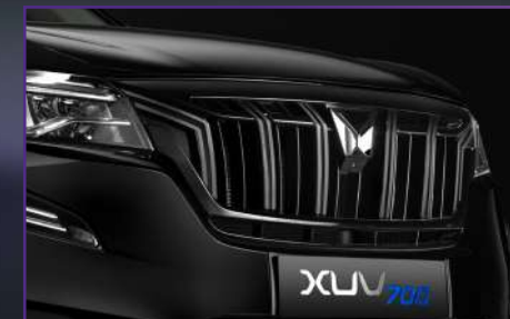
ALL-NEW BLACK FRONT GRILLE

The 2024 XUV700 screams exclusivity. The unmistakable Napoli Black finish exudes refined luxury, while cutting-edge technology effortlessly elevates the driving experience. The 2024 XUV700 is not just a symbol of elegance but a harmonious fusion of both style and innovation.