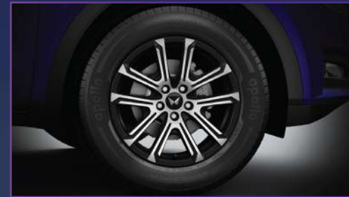
R18 DIAMOND-CUT ALLOY WHEELS