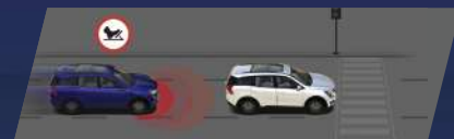
AUTOMATIC EMERGENCY BRAKING