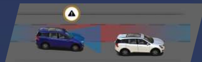
LANE KEEP ASSIST