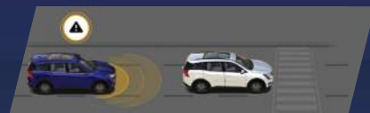
FORWARD COLLISION WARNING