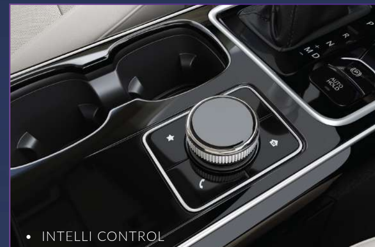
• INTELLI CONTROL

Developed in partnership with SONY Corporation, Japan, this immersive first-in-segment 12 speaker and 3D sound system is designed to take your listening experience to a whole new level.