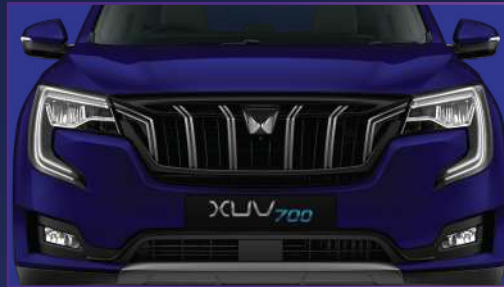
STRIKING CLEAR-VIEW LED HEADLAMPS WITH DRL AND SEQUENTIAL TURN INDICATOR