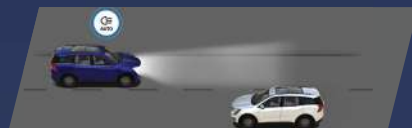
HIGH BEAM ASSIST