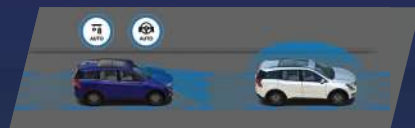
SMART PILOT ASSIST

HERE'S HOW ADAS PROTECTS YOUR XUV700 ON EVERY DRIVE: