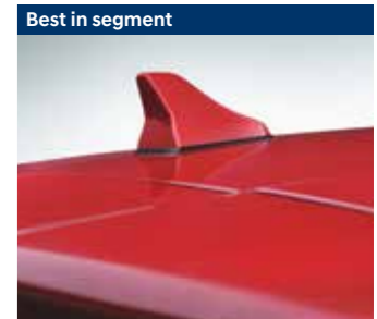
Best in segment