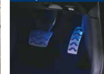
Metal pedals (Turbo only)