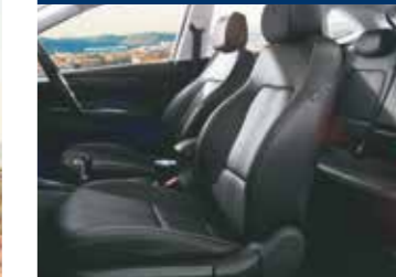
Leather* seat upholstery (Turbo only)