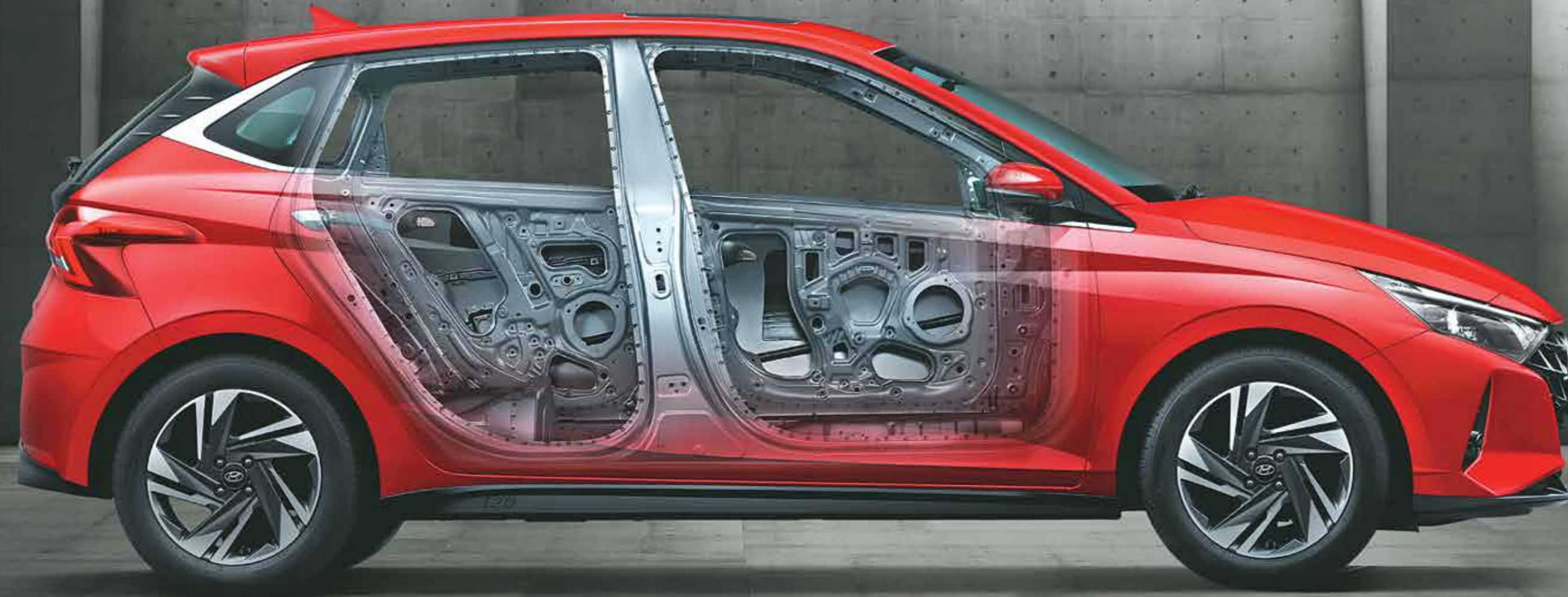
Strong body structure (with 66% AHSS and HSS)