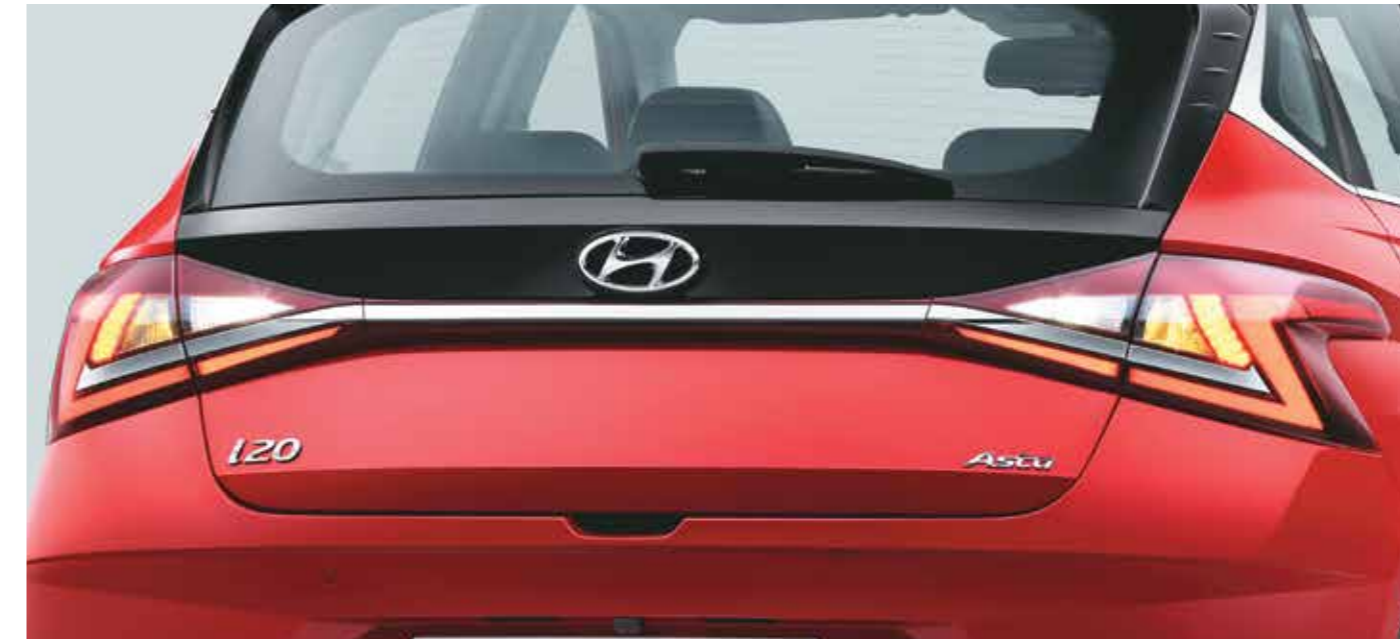
Z-shaped LED tail lamps

One look is all it takes to fall in love with the all-new i20. Its sensuous sporty design turns heads everywhere it goes. It is wider, longer and features the new electric sunroof. It's a seamless harmony of sleek looks and cutting-edge technological innovation.