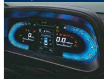
Digital cluster with TFT multi information display (MID)