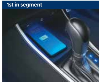
1st in segment Wireless charger with cooling pad