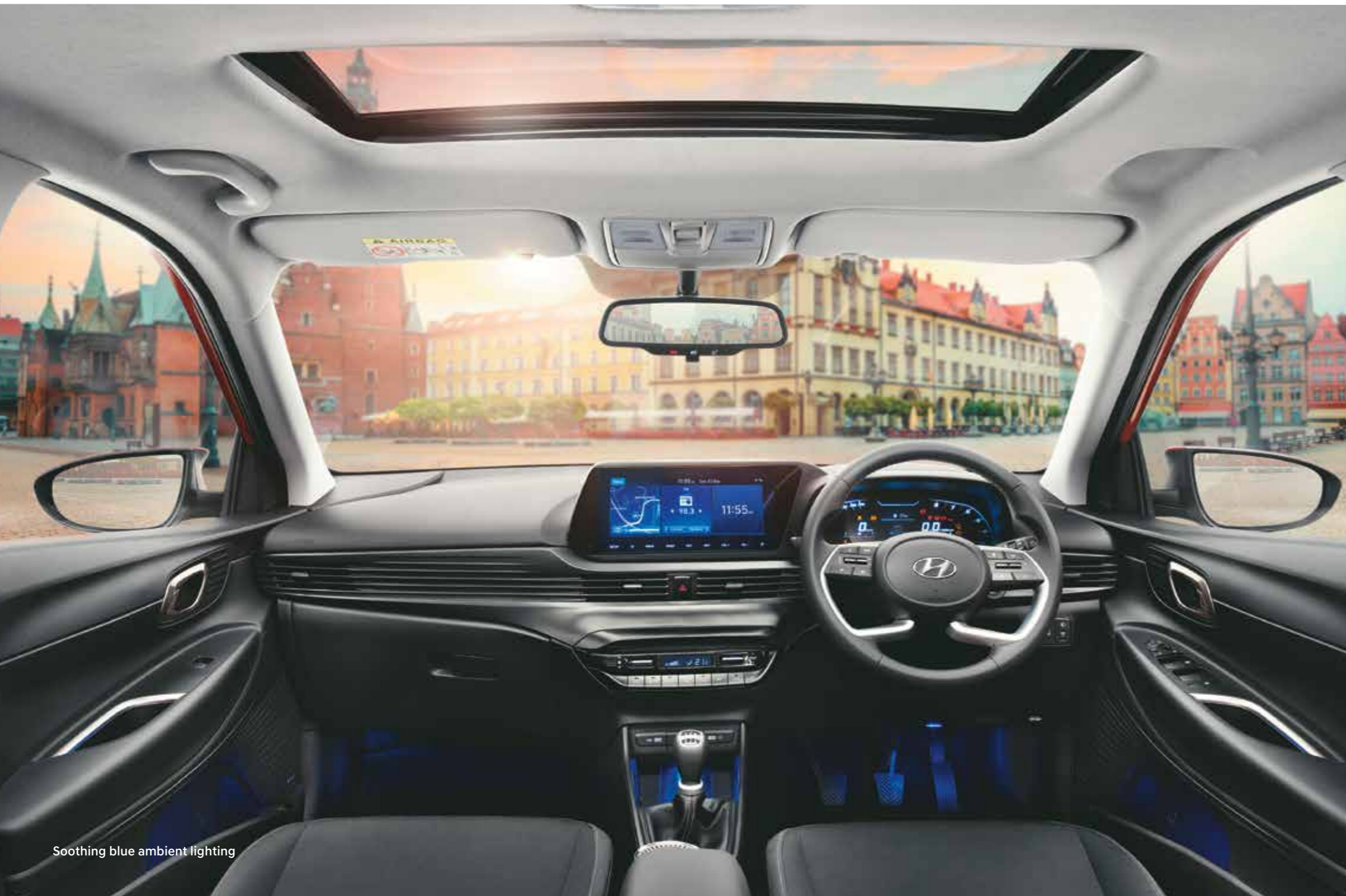
Soothing blue ambient lighting