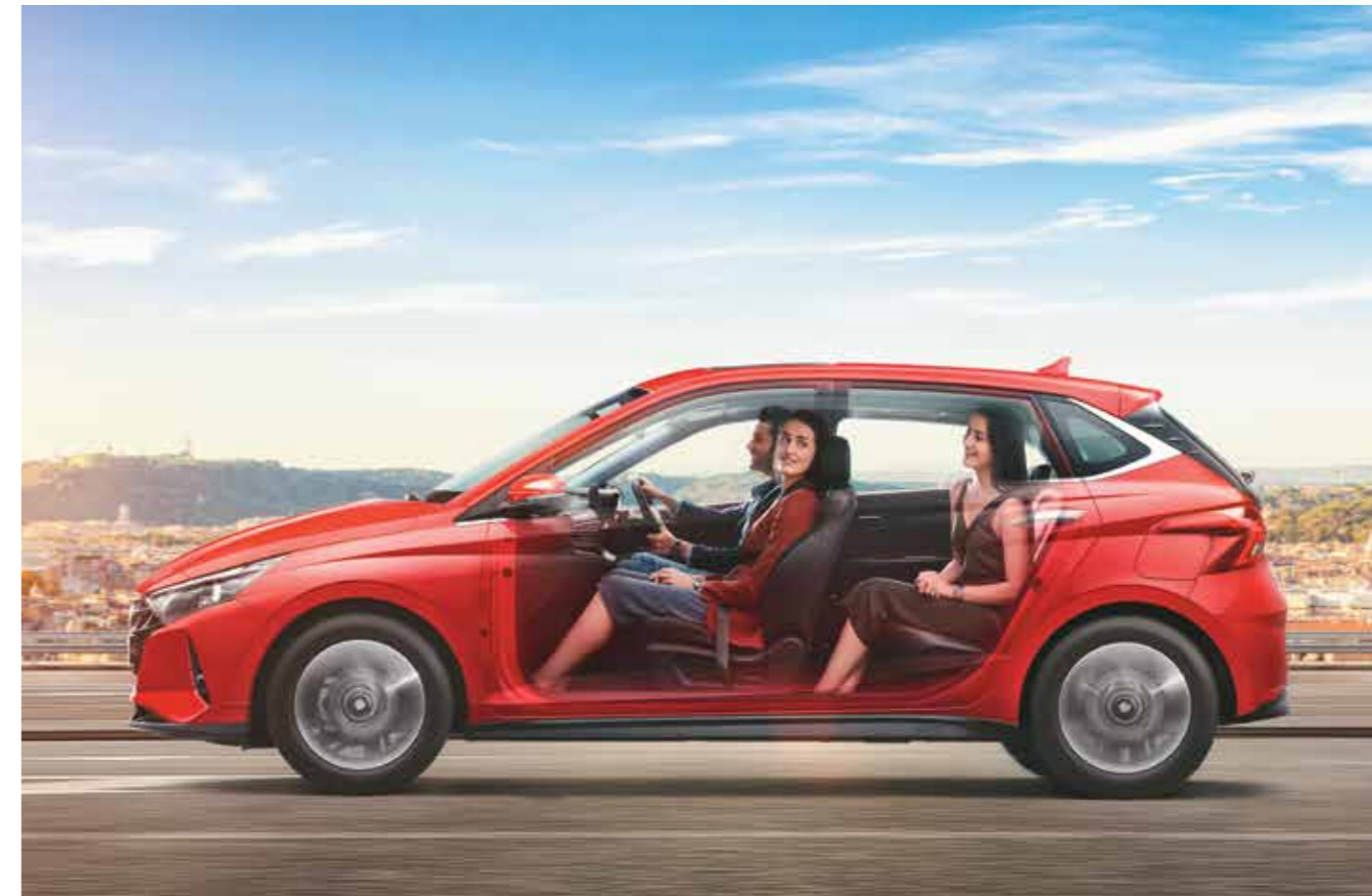
Superior leg room and thigh support

Step inside and get entranced by its exquisitely appointed, sporty black interiors with colour inserts. Relish the premium ambience every time you take it for a spin. Superior leather* upholstery and ambient lighting elevate your senses to a new high.