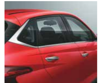
Chrome beltline with flyback rear quarter glass

Other features: Chrome outside door handles | Turn indicators on outside mirrors | Painted black finish side sill garnish with i20 branding | LED daytime running lamp (DRL) | Front projector fog lamps (Best in segment)