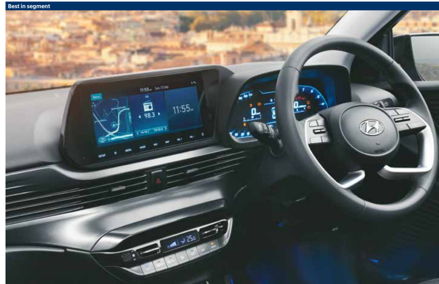
26.03 cm (10.25") HD touchscreen infotainment & navigation system