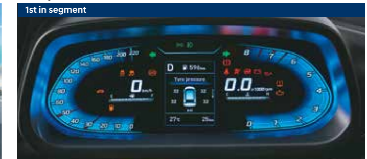
Tyre pressure monitoring system (highline) with display on MID

Other features: Impact sensing auto door unlock | Speed sensing auto door lock | Rear defogger with timer | Central locking (door & tailgate) | Automatic headlamps | Head lamp escort function | Burglar alarm | Driver rear view monitor (DRVM) | Emergency stop signal (1st in segment) | Height adjustment seat belt - driver & passenger | Rear camera with dynamic guidelines | ISOFIX