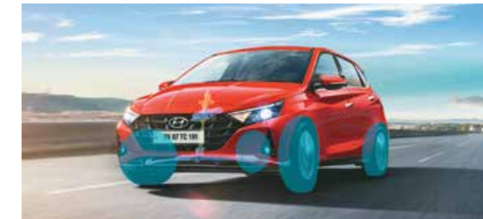
Electronic stability control (ESC) with vehicle stability management (VSM)