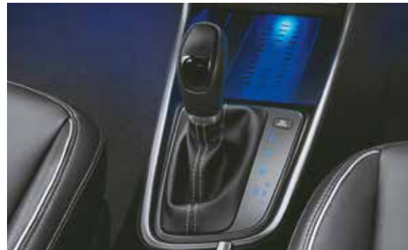
DCT & IVT