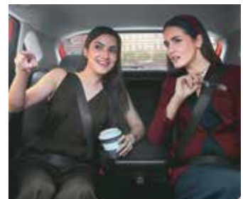
Rear seat armrest