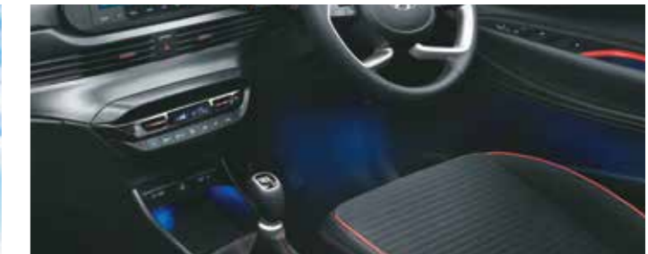
Sporty black interiors with red inserts

Other features: Front & rear adjustable headrests | Leather* wrapped gear knob | Sliding front armrest (Best in segment) Leather* wrapped steering wheel | Sleek dashboard | Metal finish inside door handles