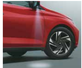
Puddle lamps with welcome function