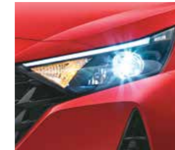
LED projector headlamps