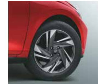
R16 (D=405.6 mm) diamond cut alloy wheels