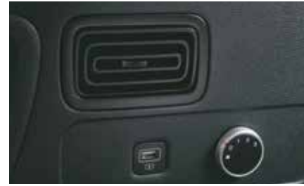
3<sup>rd</sup> row AC vents with speed control (3-stage)