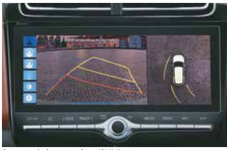
Surround view monitor (SVM)