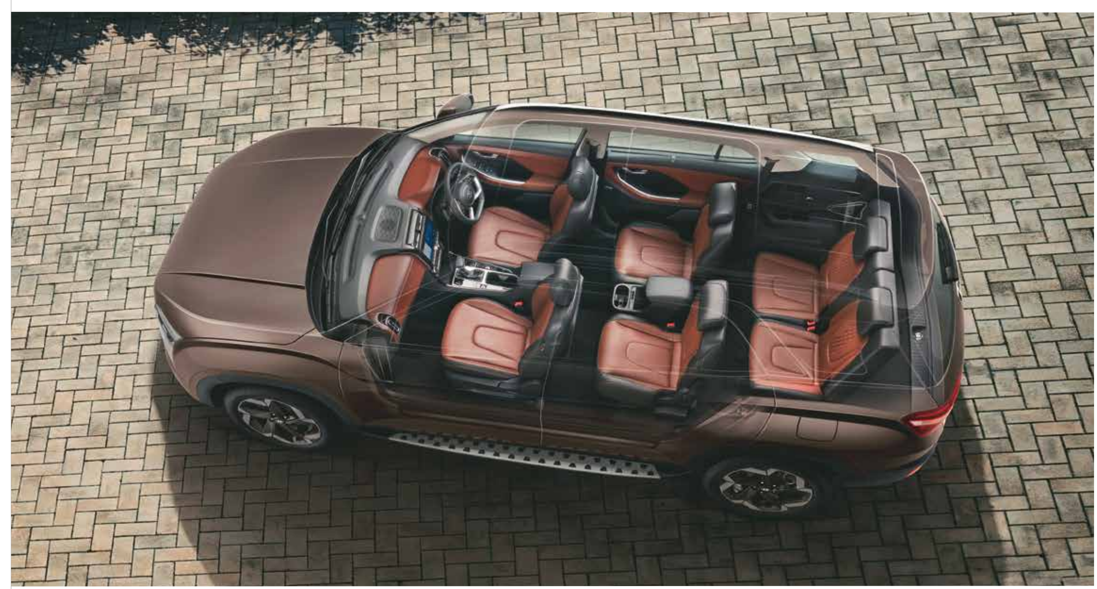
Leather pack: Perforated D-cut steering wheel | Perforated gear knob | Cognac brown and black seat upholstery | Door armrest

The interior of the Hyundai ALCAZAR immerses you in uncluttered design. Complete with premium dual tone cognac brown interiors, the 64 colours ambient lighting offers a regal touch to the cabin. Carefully selected materials accentuate the aesthetic, complete with Hyundai ALCAZAR's advanced technology, ensuring that your entertainment knows no bounds. Experience serenity thanks to a voice controlled panoramic sunroof and an auto healthy air purifier. The tranquil sanctuary is also outfitted with an HD touchscreen system with powerful Bose premium sound system, immersing you in a rich and balanced premium audio experience.