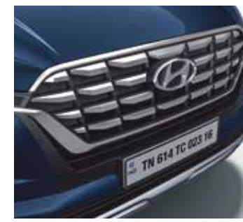
Dark chrome grille*