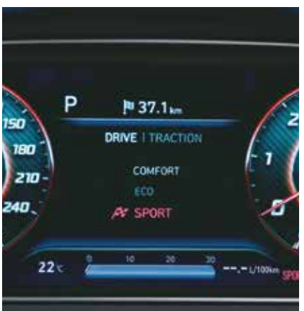
Drive mode select