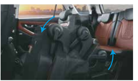
2<sup>nd</sup> row - one touch tip tumble captain & split seats