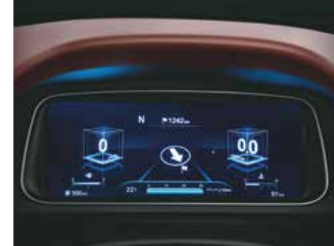
26.03 cm (10.25") Multi display digital cluster with personalized themes