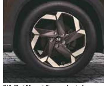
R18 (D=462 mm) Diamond cut alloys