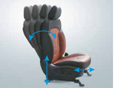
ower driver seat – 8 way