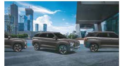
Parking assist: Front and rear parking sensors

Other features: Emergency stop signal | Speed alert system | Speed sensing auto door lock | Driver rear view monitor Impact sensing auto door unlock | Child seat anchor (ISOFIX) | Electric parking brake with auto hold