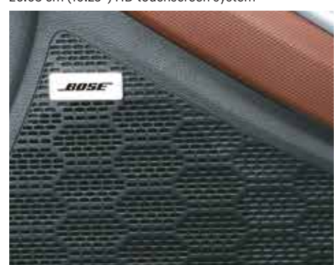
Bose premium sound system (8 speakers)