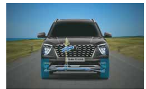
Vehicle stability managment (VSM)