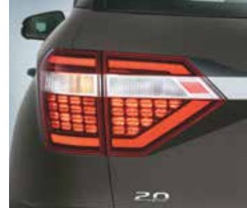
ney-comb inspired LED tail lar