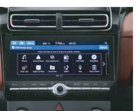
26.03 cm (10.25") HD touchscreen system