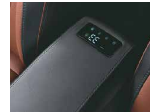
Auto healthy air purifier with AQI display