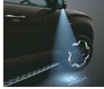
Puddle lamps with logo projection