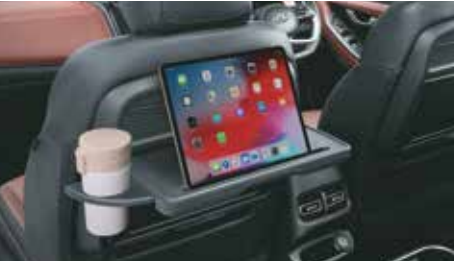
Front row seatback table with retractable cup-holder and IT device holder