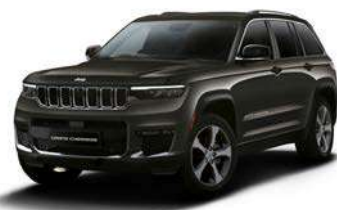
ROCKY MOUNTAIN PEARL COAT