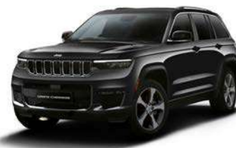
DIAMOND BLACK CRYSTAL P/C