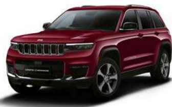
VELVET RED PEARL COAT