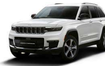
BRIGHT WHITE CLEAR COAT