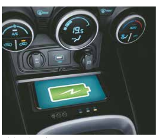
Wireless phone charger