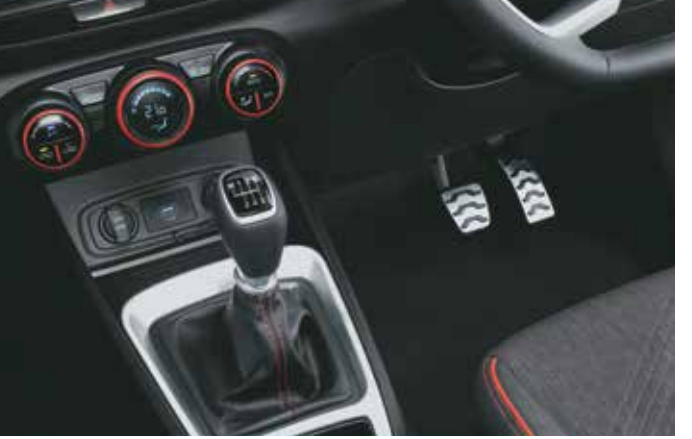
Intelligent manual transmission (iMT)