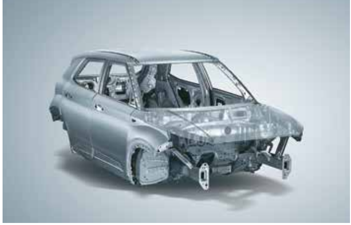
High structural safety (AHSS & HSS)