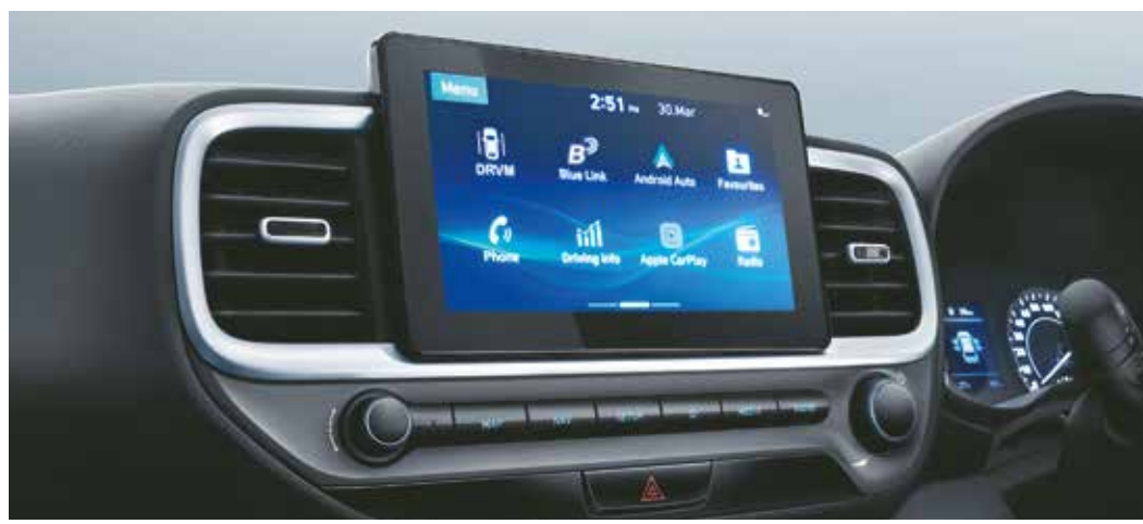
HD display on 20.32 cm (8.0") AVN with telematics