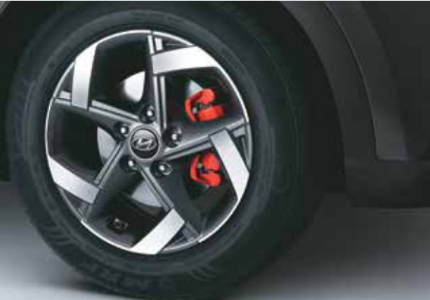
Red brake calipers