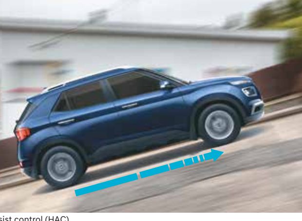
Hill-assist control (HAC)