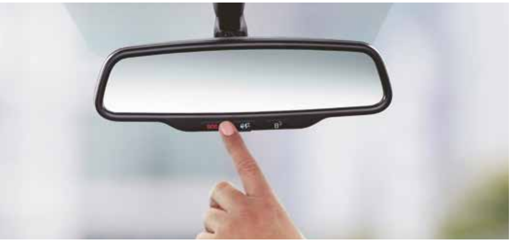
IRVM with Bluelink