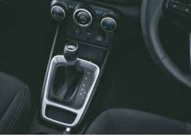
Dual clutch transmission (DCT)

6-speed manual, Intelligent manual transmission & 7-speed DCT