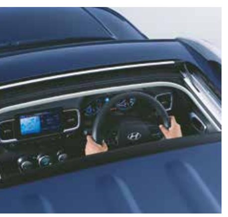
Smart electric sunroof