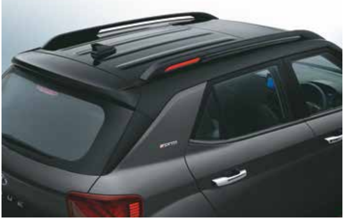
Dark grey roof rail with red insert