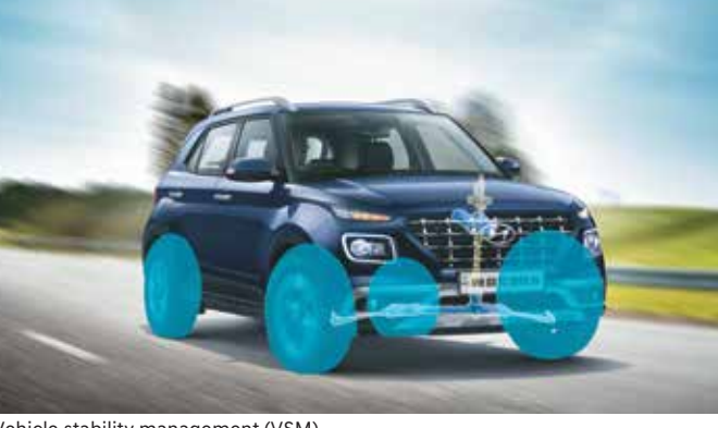
Vehicle stability management (VSM)