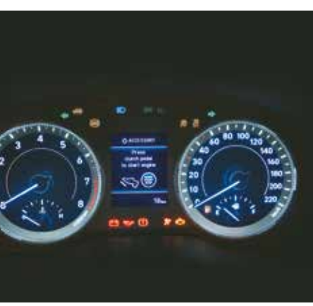
Advanced supervision cluster with rheostat