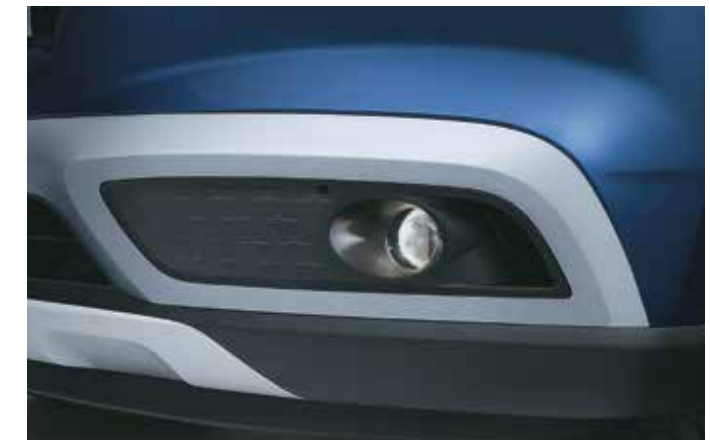
Projector fog lamps