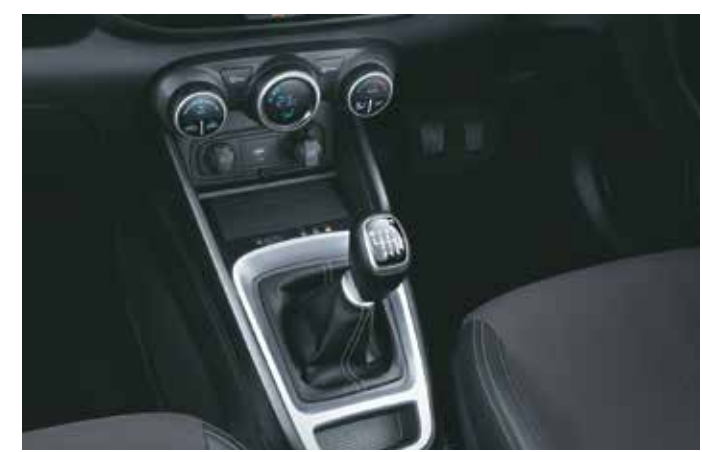
Manual transmission (MT)