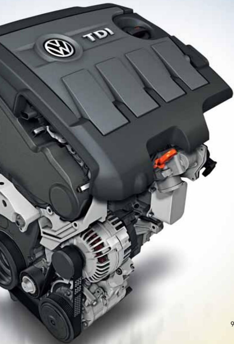
1.5L TDI Engine 90PS (66kW) Power 230 Nm Torque