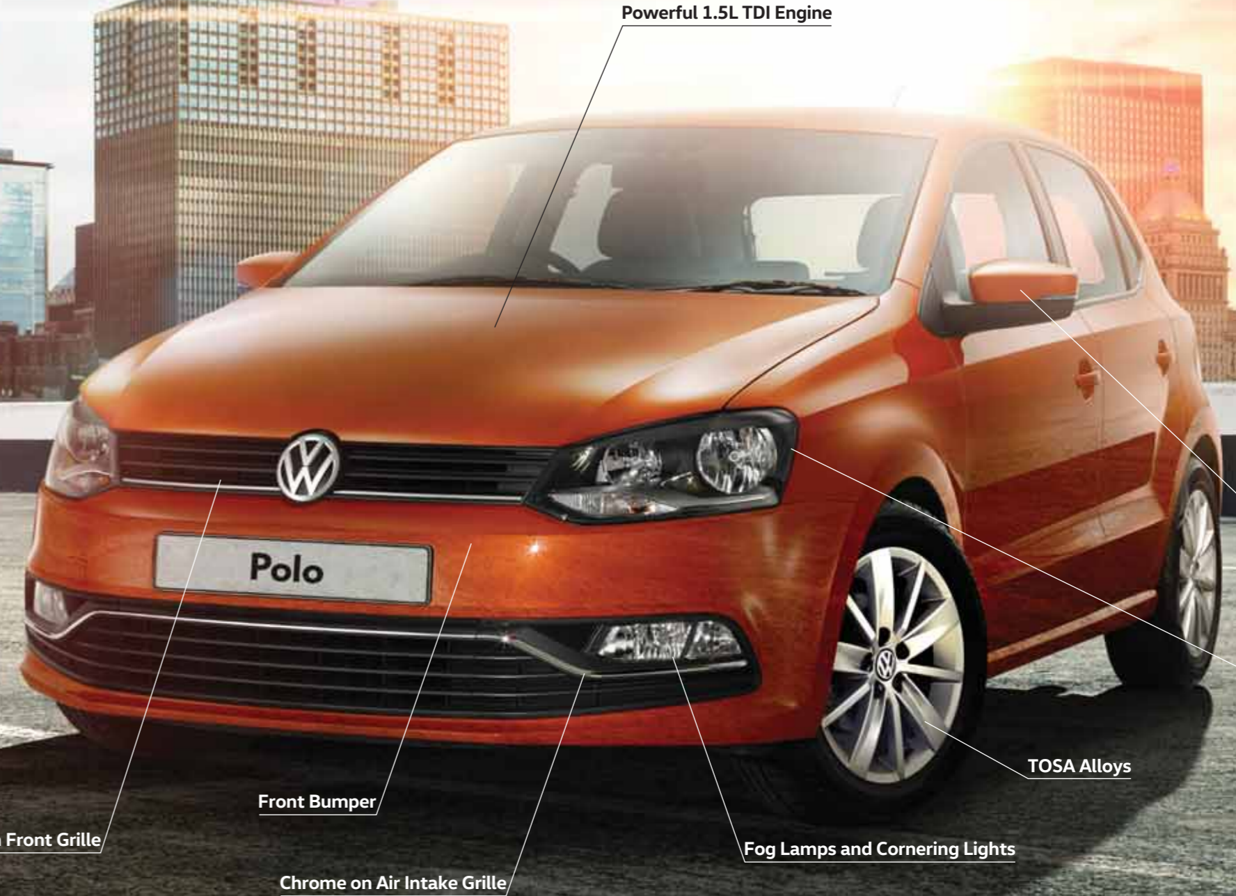
Powerful 1.5L TDI Engine