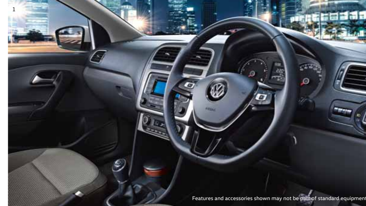
Features and accessories shown may not be part of standard equipment