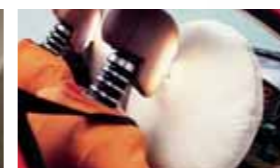
Dual-front Airbags as Standard