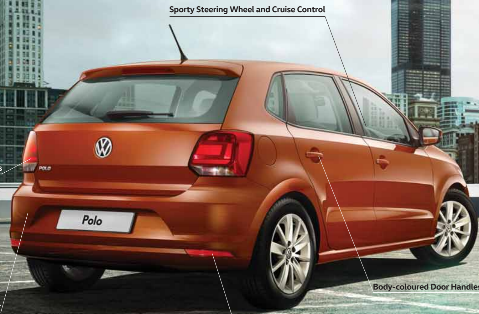
Sporty Steering Wheel and Cruise Control