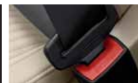
3-point Seat Belts