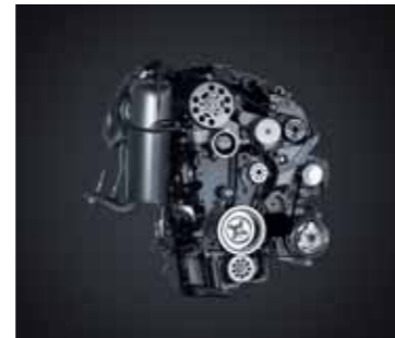
1.2L MPI Petrol Engine