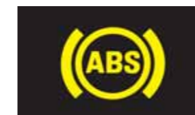
Anti-lock Braking System (ABS)

Rated the Safest Premium Hatchback in its Segment in India