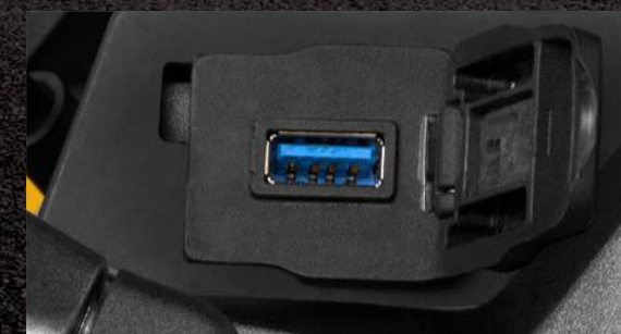
USB FAST CHARGING