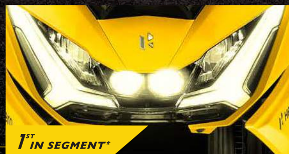
CLASS-D LED PROJECTOR HEADLAMP WITH INTELLIGENT ILLUMINATION