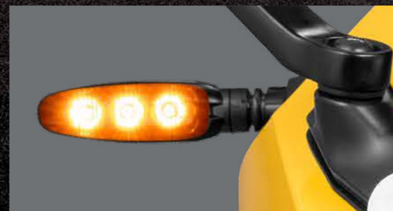
LED WINKERS THAT ADD FLAIR AND FUNCTIONALITY