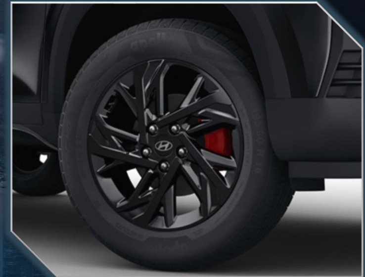
R17 black alloy wheels with RED Callipers (front & rear)