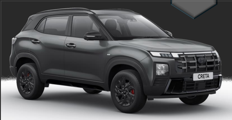
Shadow grey with Abyss black roof (Dual-tone)