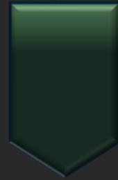
Robust emerald pearl