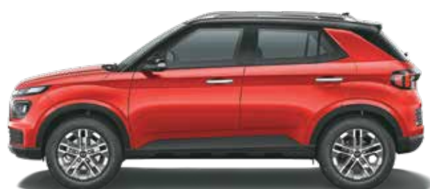
Fiery red with phantom black roof