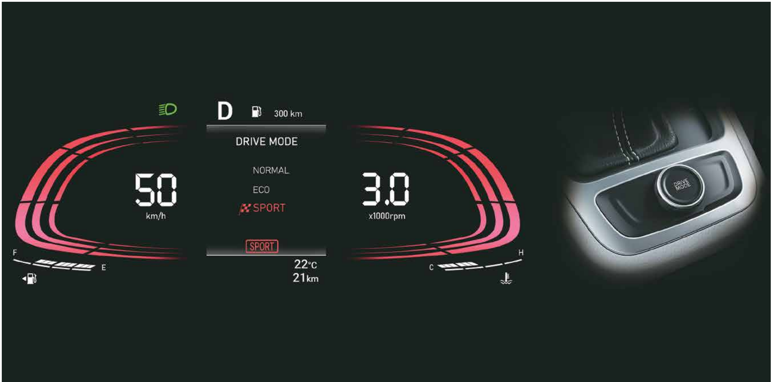
Drive mode select (Normal, Eco, Sport)