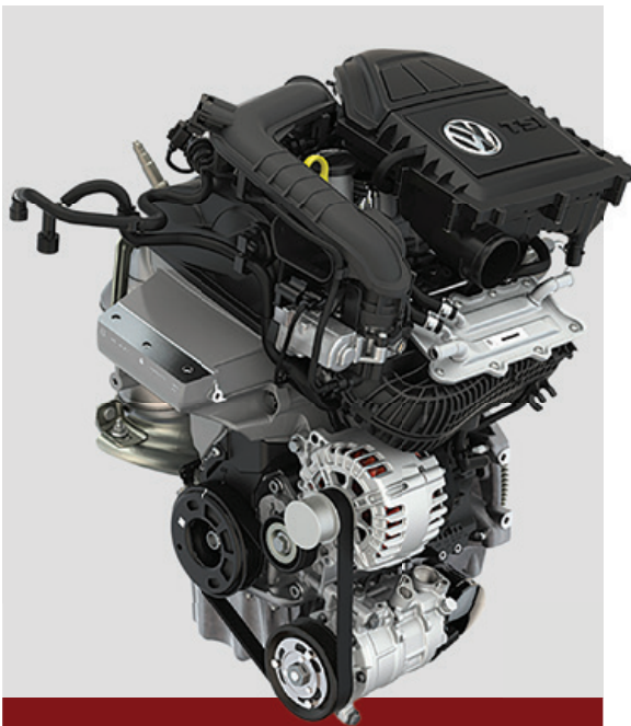
1.0L TSI engine