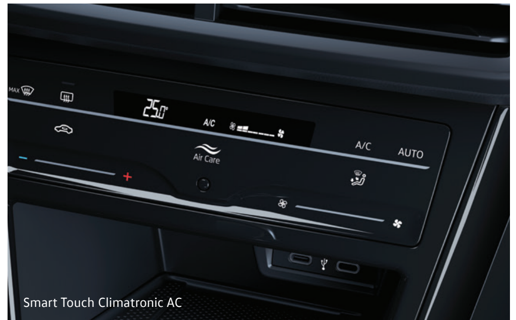
Smart Touch Climatronic AC

With a myriad of safety, convenience and connectivity features on board, the Virtus truly is a marvel of German-engineering.