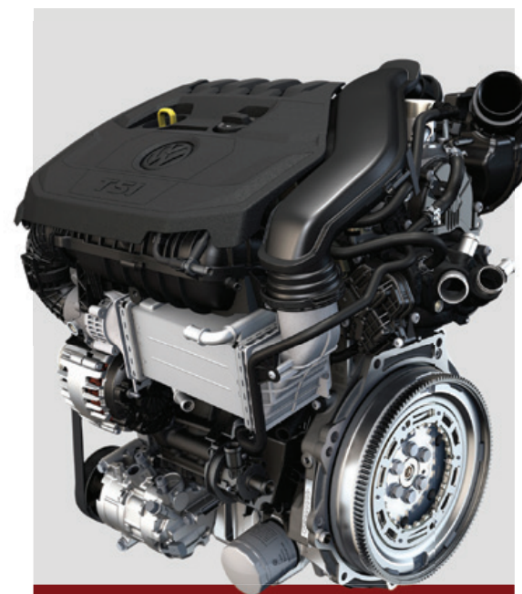
1.5l TSI EVO engine