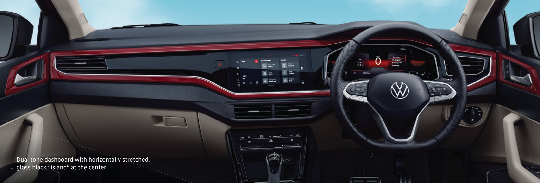
Dual tone dashboard with horizontally stretched, gloss black "island" at the center

With a best-in-segment wheelbase (2561 mm*), the Virtus is spacious as can be. The digital cockpit and infotainment system placed in a high-gloss black "island" at the centre is a guaranteed conversation starter. Premium leatherette seats with contrast stitching carry the performance oriented design to the inside. Chrome detailing and premium materials in the Virtus' interiors exude a refined elegance.