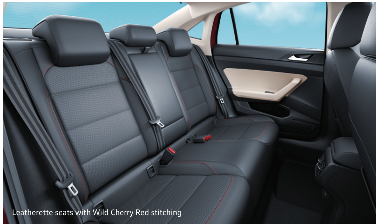
Leatherette seats with Wild Cherry Red stitching

With a best-in-segment wheelbase (2561 mm*), the Virtus is spacious as can be. The digital cockpit and infotainment system placed in a high-gloss black "island" at the centre is a guaranteed conversation starter. Premium leatherette seats with contrast stitching carry the performance oriented design to the inside. Chrome detailing and premium materials in the Virtus' interiors exude a refined elegance.