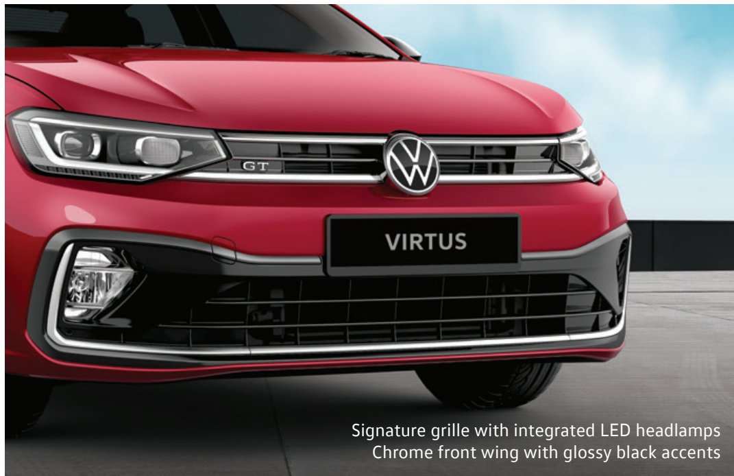
Signature grille with integrated LED headlamps Chrome front wing with glossy black accents