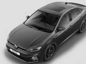
Carbon Steel Grey