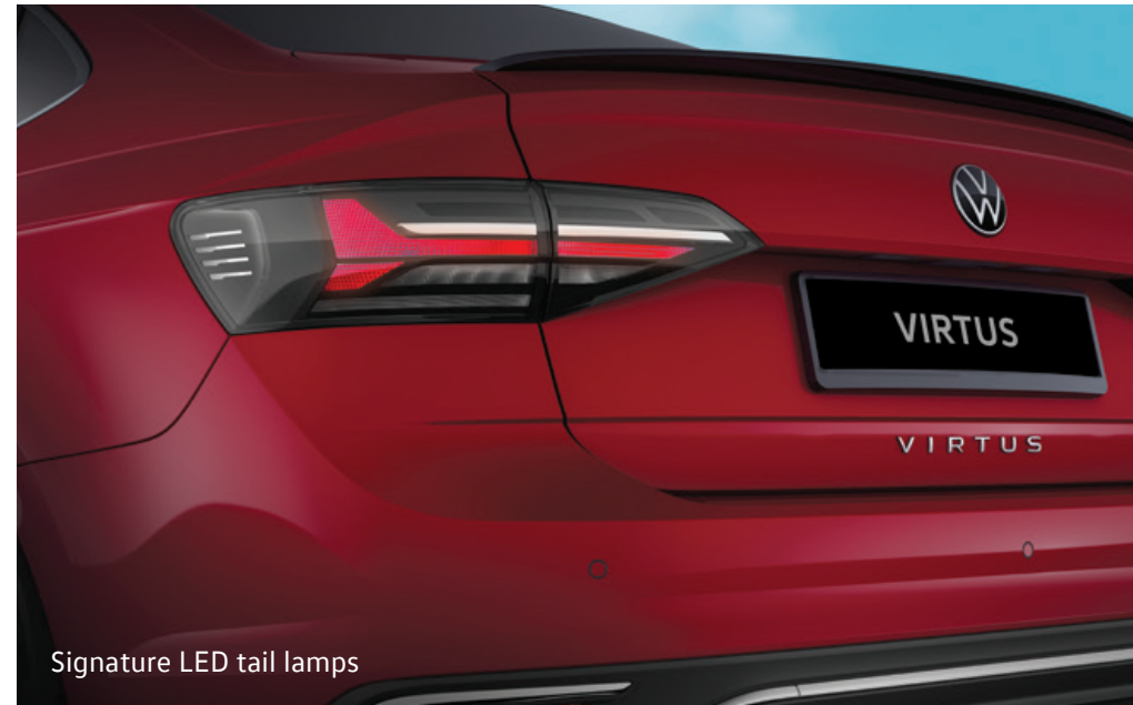
Signature LED tail lamps

Striking. Exhilarating. German-engineered. The new Volkswagen Virtus is crafted for those who live for alive. Who chase experiences. And who love nothing more than the freedom of driving in a sedan crafted to thrill.