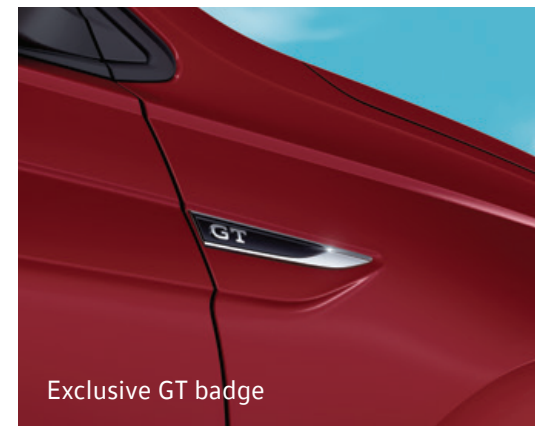
Exclusive GT badge

When it comes to the thrill of driving, the GT badged Performance Line is as invigorating as it gets. It's powered by the revolutionary 1.5l TSI EVO engine generating 150 PS* of power and 250 Nm* of torque with active cylinder technology mated to either a 6-speed manual transmission or a 7-speed DSG transmission. Paddle shifters, aluminum pedals, sporty spoiler on its boot, and red calipers on the front wheels give the Performance Line a distinct, thoroughbred look.