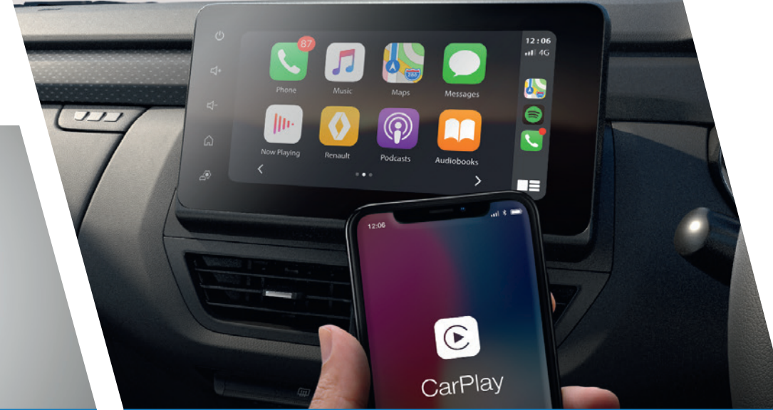
display link floating touchscreen with wireless smart phone replication