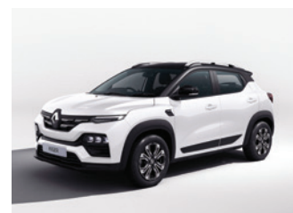
ice cool white