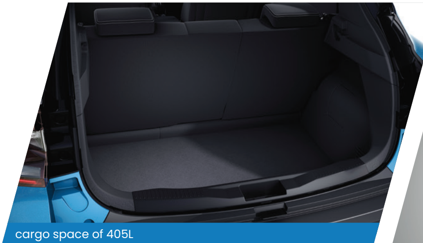
cargo space of 405L