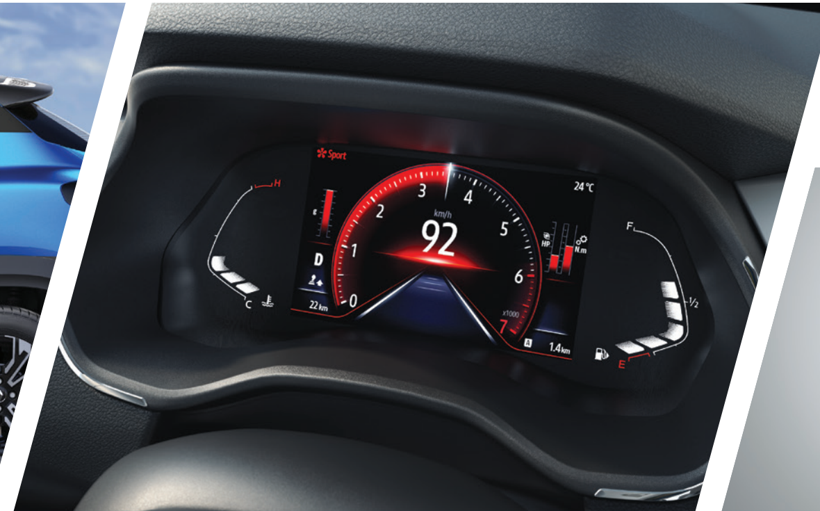
multi-skin 17.78 cm reconfigurable TFT cluster