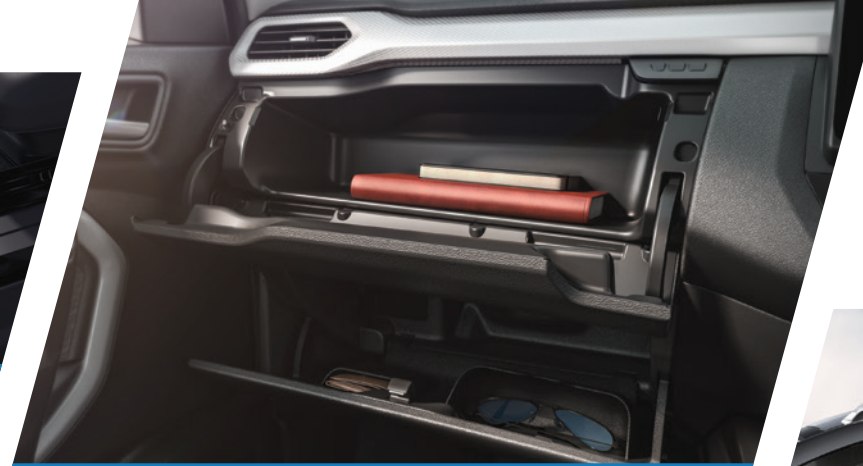
glove boxes volume of 14.9L