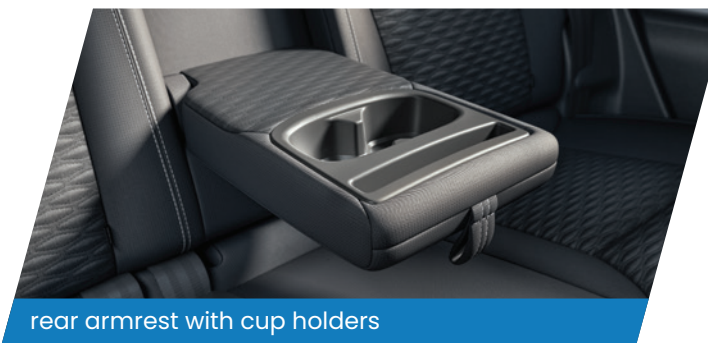
rear armrest with cup holders

The Renault KIGER's high cabin storage volume has you ready for the new, when you hit the road with your group. Get space for all your belongings with the 405L boot space that can be enhanced to 879L by folding rear seats. There's also additional storage space of 14.9L in upper and lower glove boxes and 7.5L in the centre console storage compartment. The KIGER's rear row comes with a knee room of 222 mm, a flat floor and elbow width of 1431 mm to help comfortably seat three.