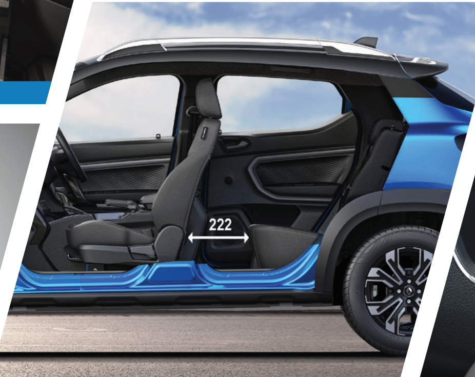
rear knee room of 222 mm