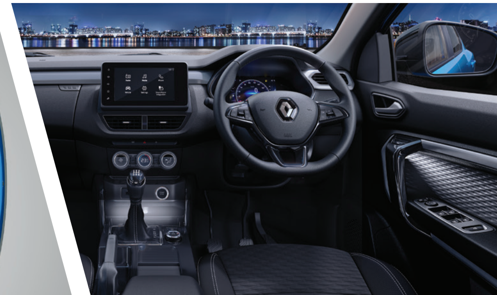
interior ambient illumination with control switch