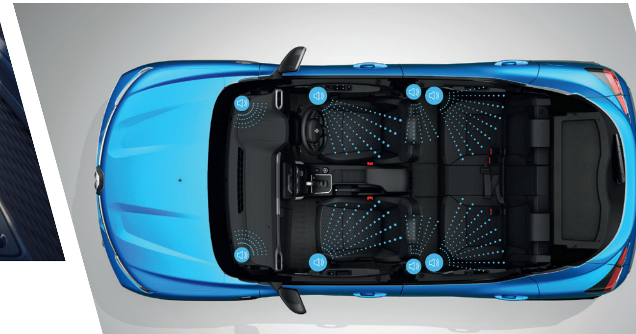
3D sound by ARKAMYS® (4 speakers + 4 tweeters)