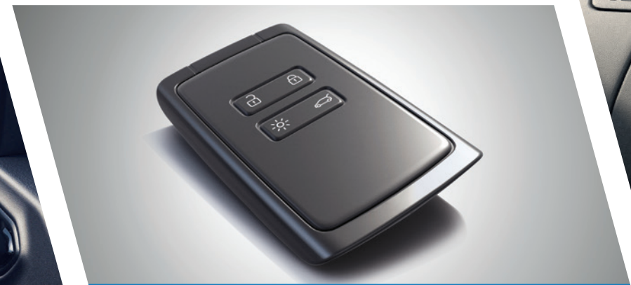
smart access card