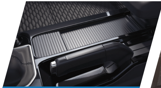
high centre console with 7.5L