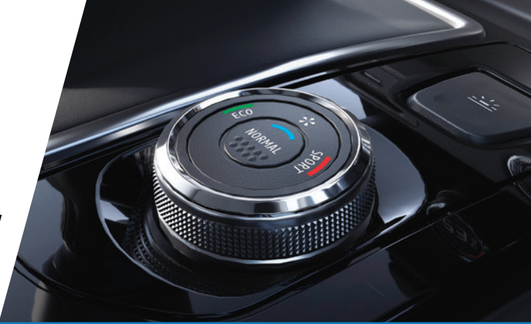
multi-sense drive modes