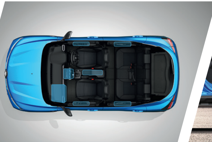
total cabin storage volume of 29L