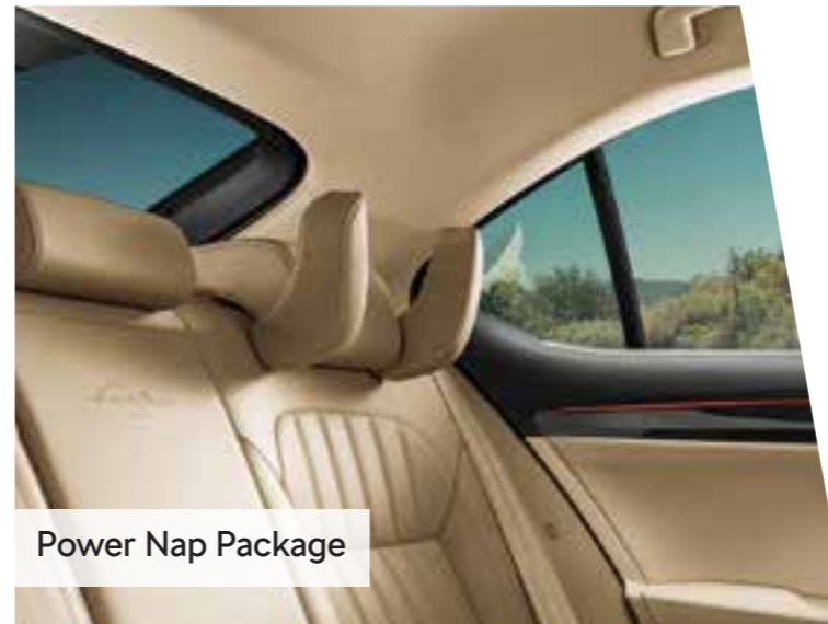
Power Nap Package