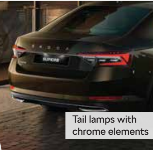
Tail lamps with chrome elements