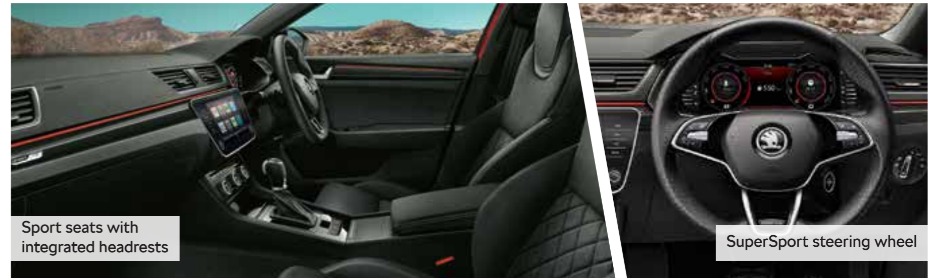
Sport seats with integrated headrests