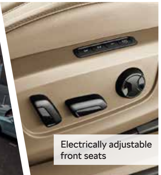
Electrically adjustable front seats