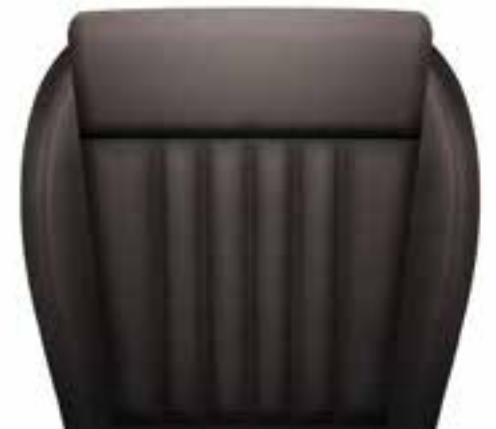
Coffee Brown perforated leather