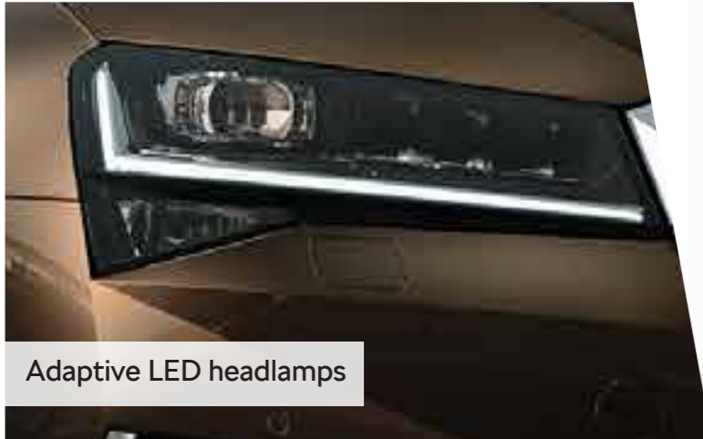
Adaptive LED headlamps