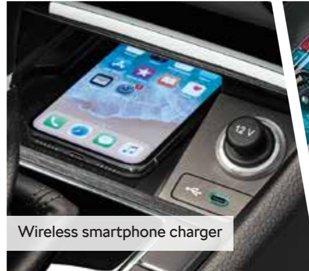
Wireless smartphone charger