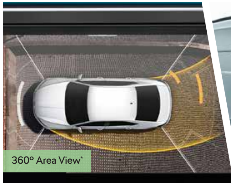
360° Area View*