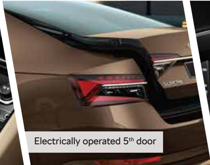
Electrically operated 5 th door