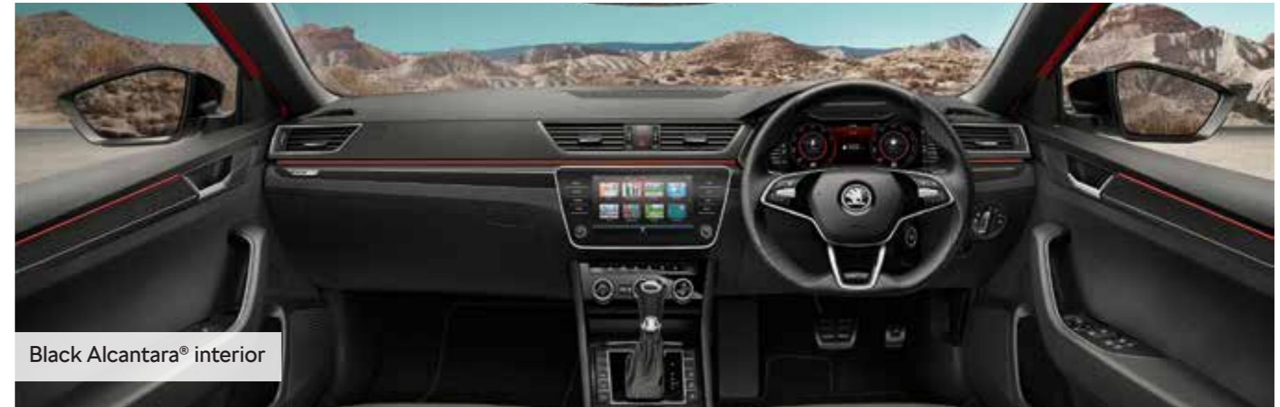
Black Alcantara® interior