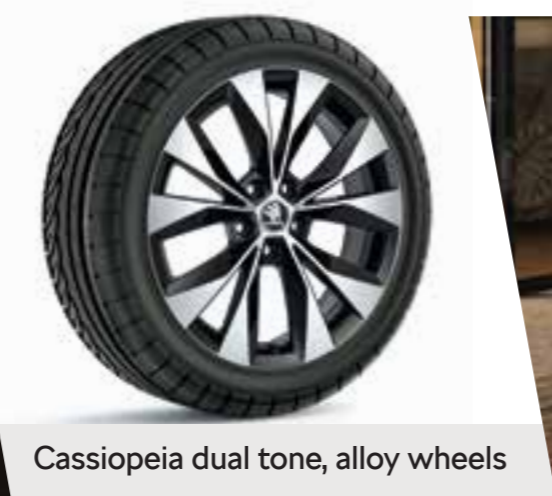
Cassiopeia dual tone, alloy wheels