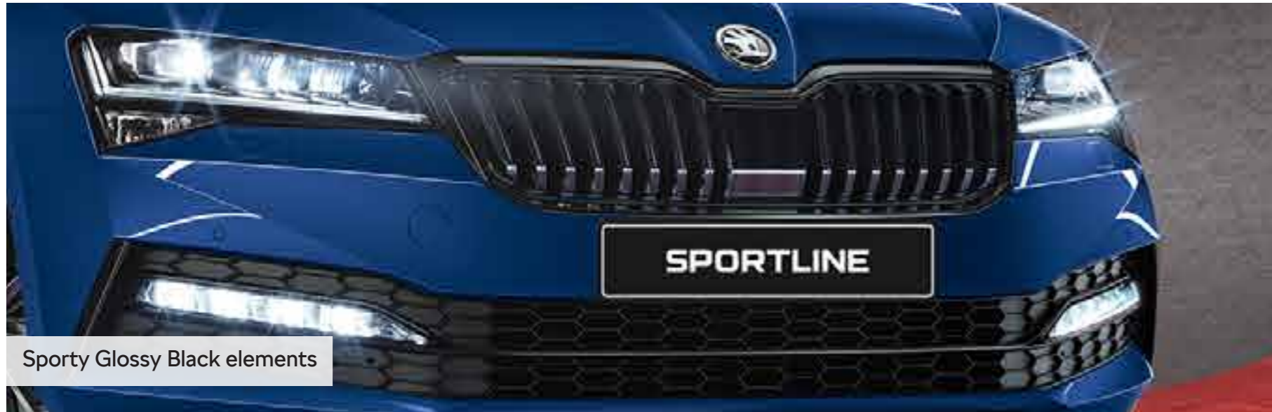
Sporty Glossy Black elements