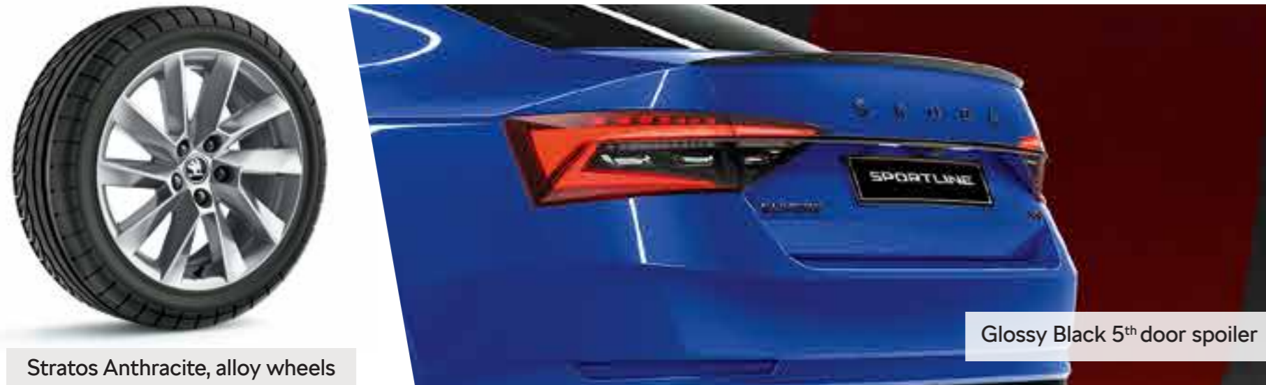
Stratos Anthracite, alloy wheels