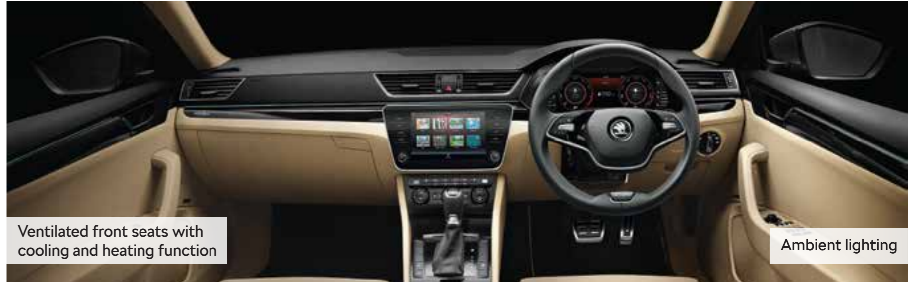
Ventilated front seats with cooling and heating function