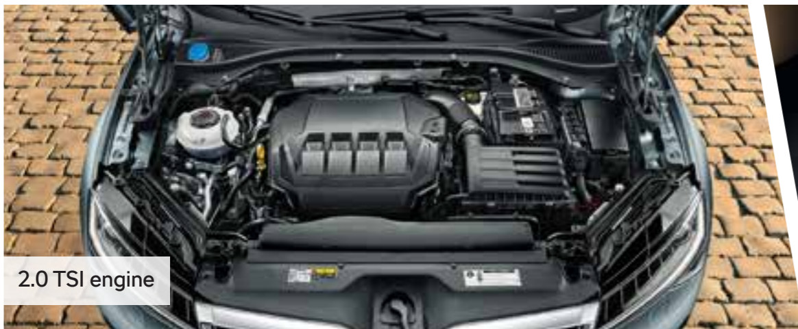
2.0 TSI engine