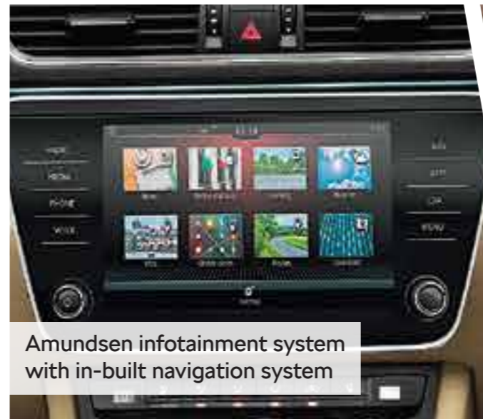
Amundsen infotainment system with in-built navigation system