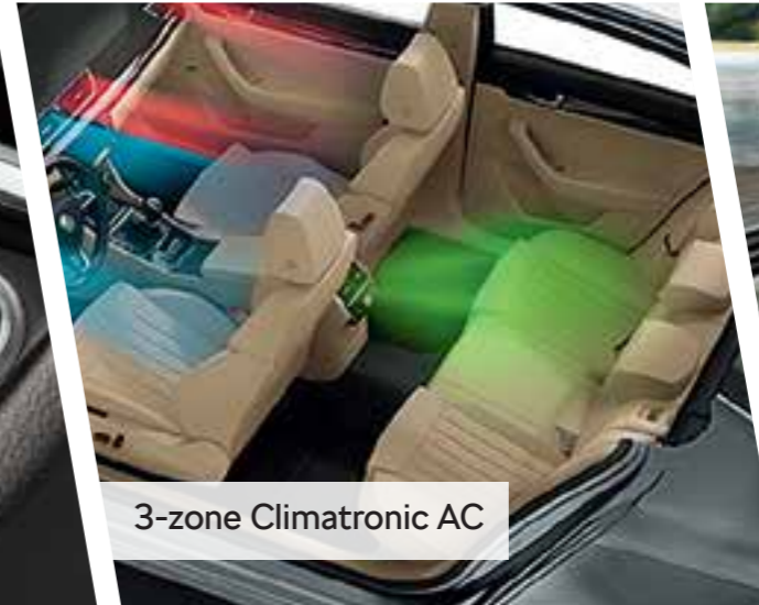
3-zone Climatronic AC