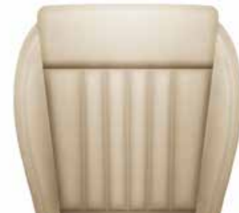
Stone Beige perforated leather