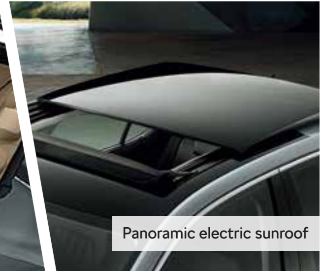
Panoramic electric sunroof