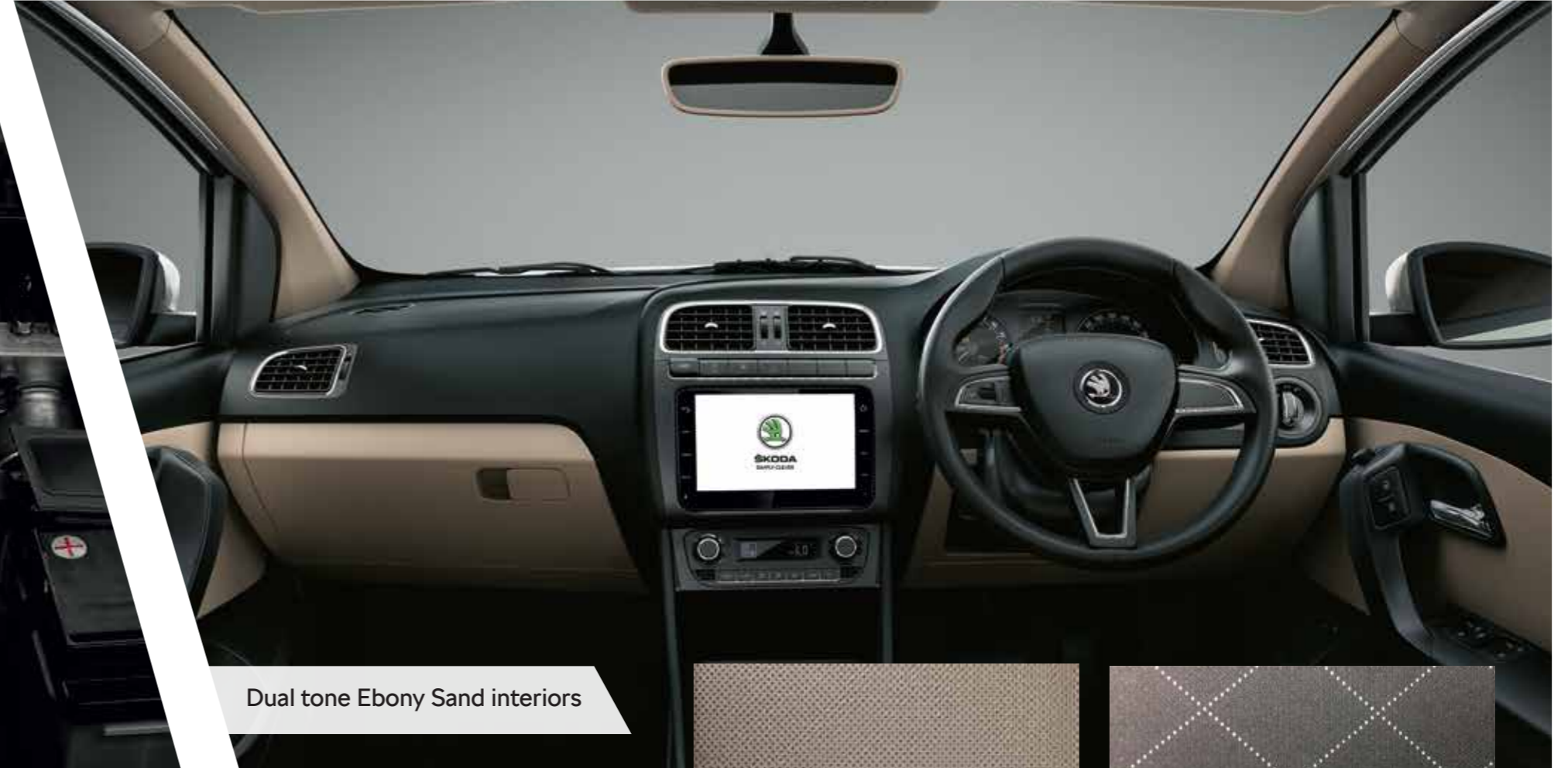
Dual tone Ebony Sand interiors