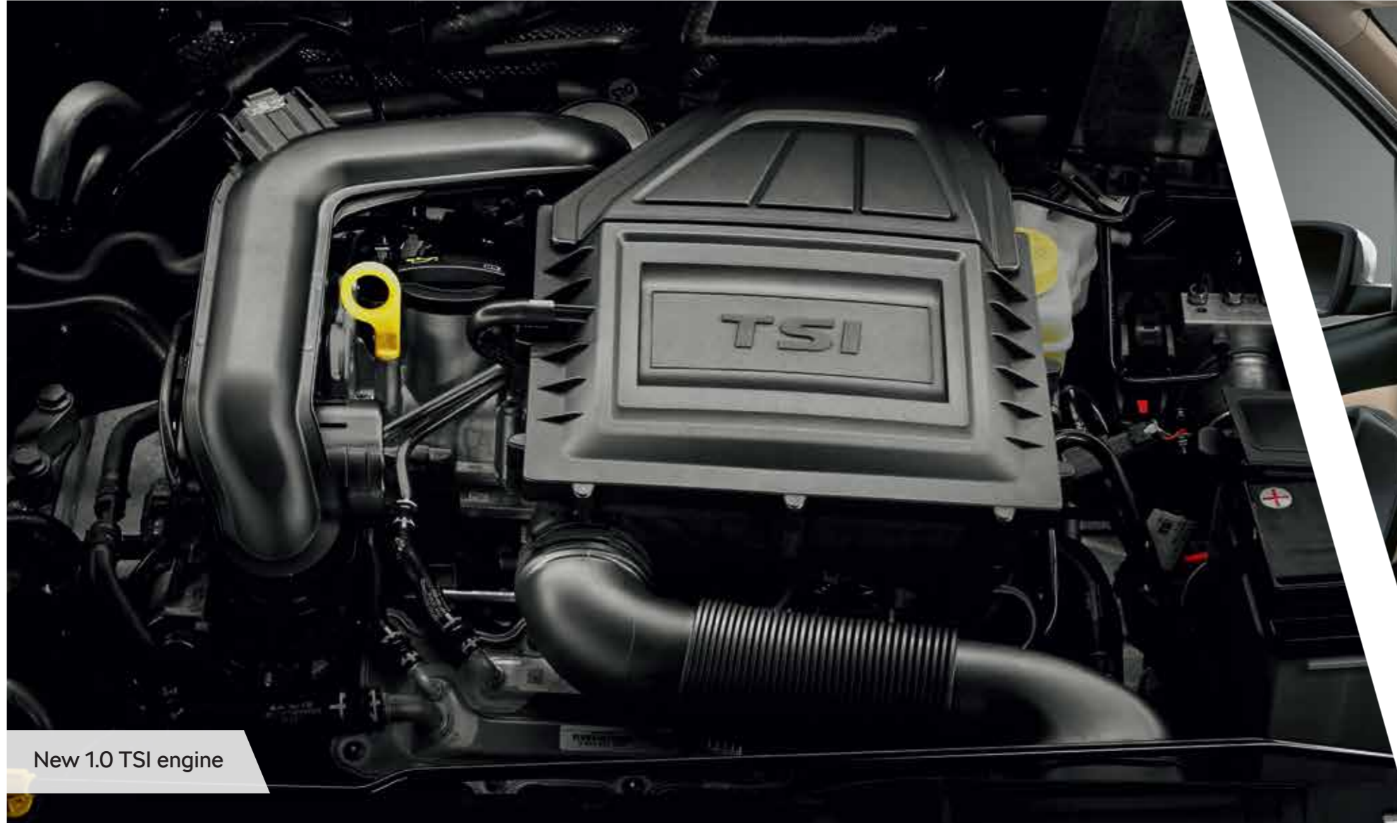
New 1.0 TSI engine