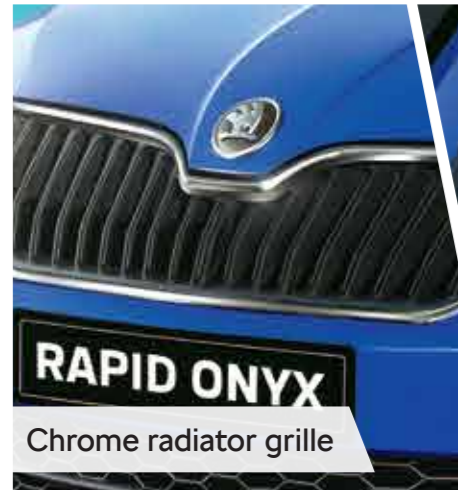
Chrome radiator grille