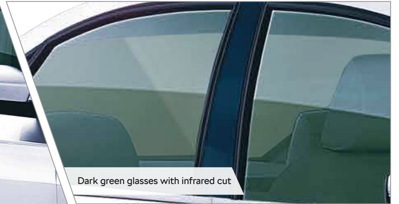
Dark green glasses with infrared cut