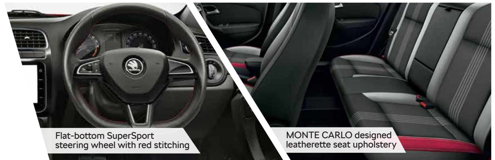
Flat-bottom SuperSport steering wheel with red stitching