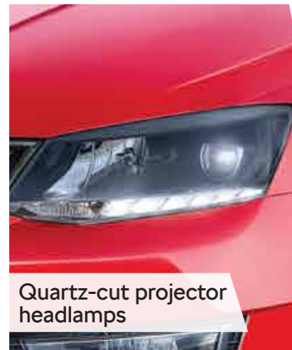
Quartz-cut projector headlamps