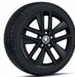
Glossy black Clubber, alloy wheels