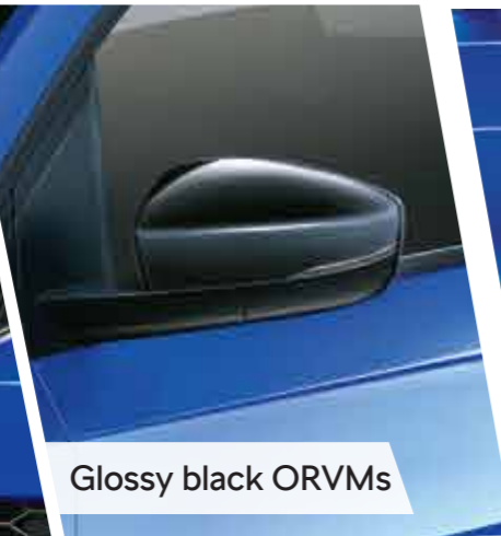
Glossy black ORVMs