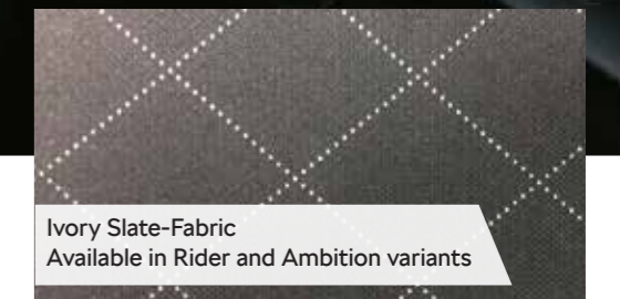
Ivory Slate-Fabric Available in Rider and Ambition variants