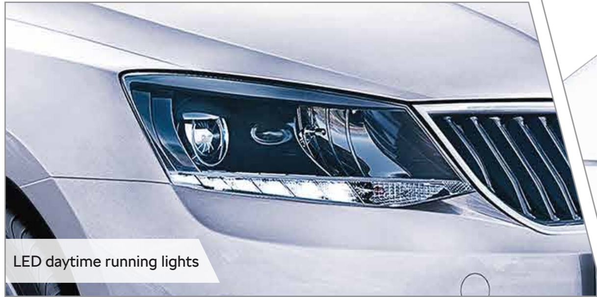
LED daytime running lights