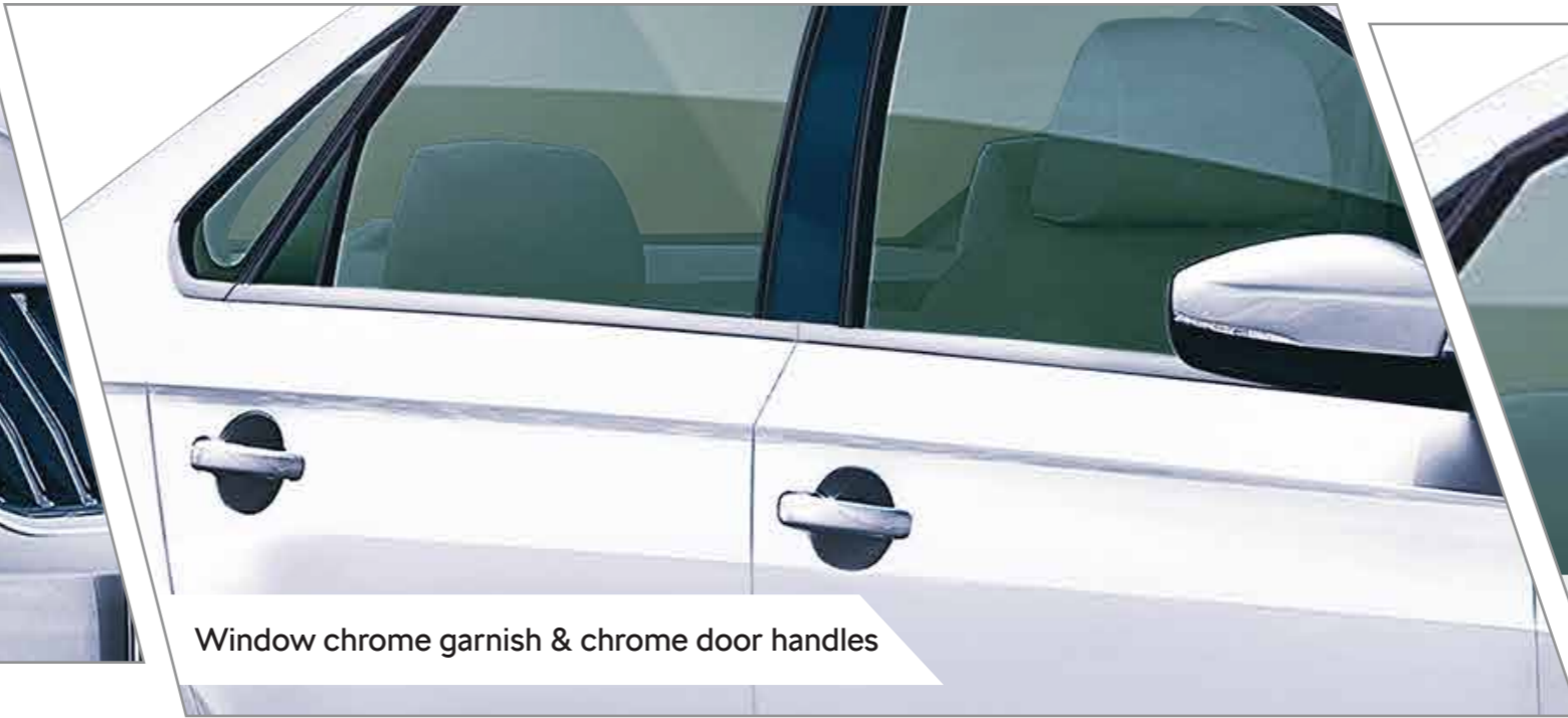
Window chrome garnish & chrome door handles