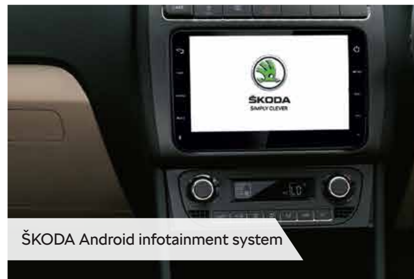
ŠKODA Android infotainment system