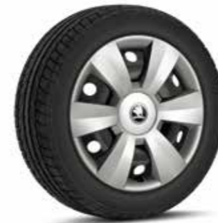
Dentro, R15 Available in Rider variant