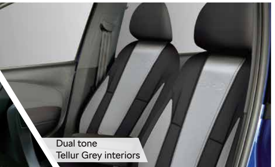
Dual tone Tellur Grey interiors