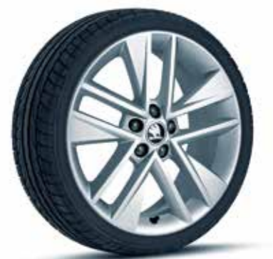
Clubber, R16 Available in Style variant