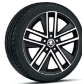
Dual tone Clubber, alloy wheels