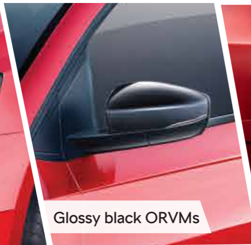
Glossy black ORVMs