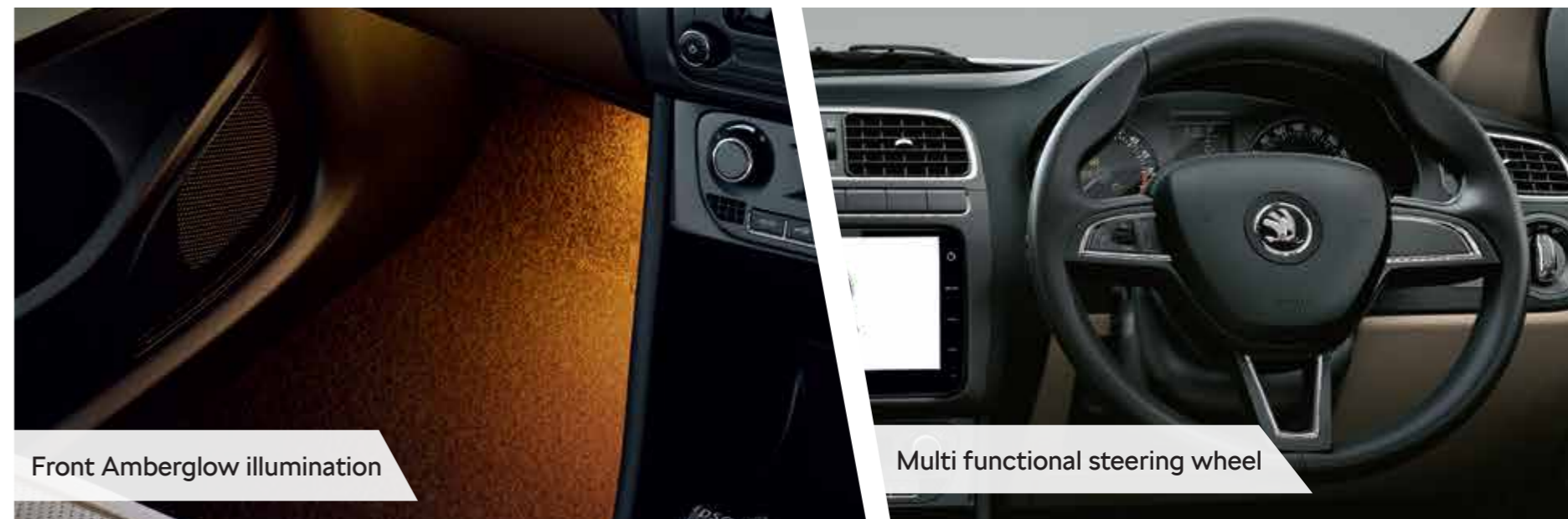
Front Amberglow illumination