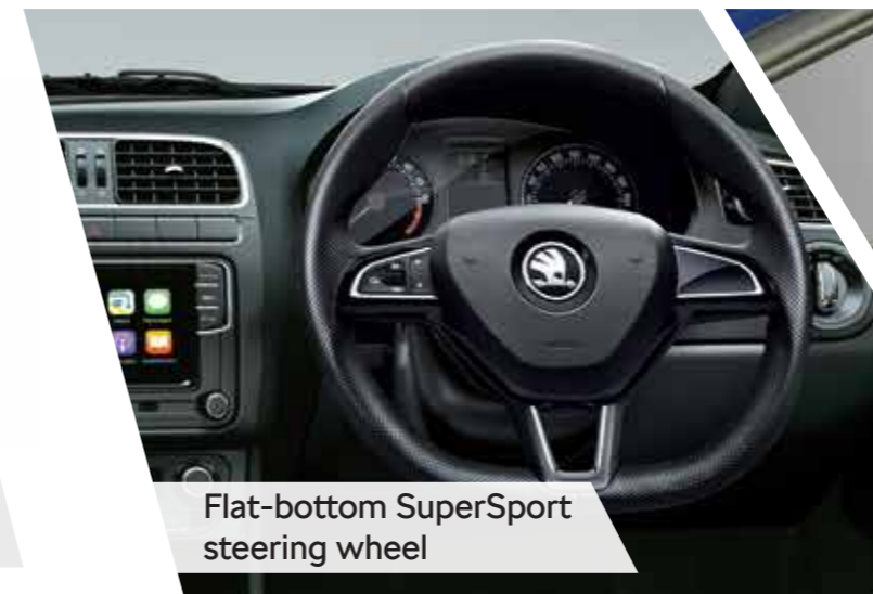
Flat-bottom SuperSport steering wheel