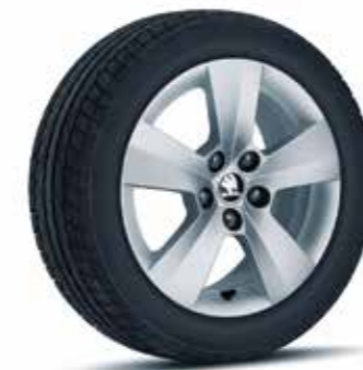
Matone, R15 Available in Ambition variant