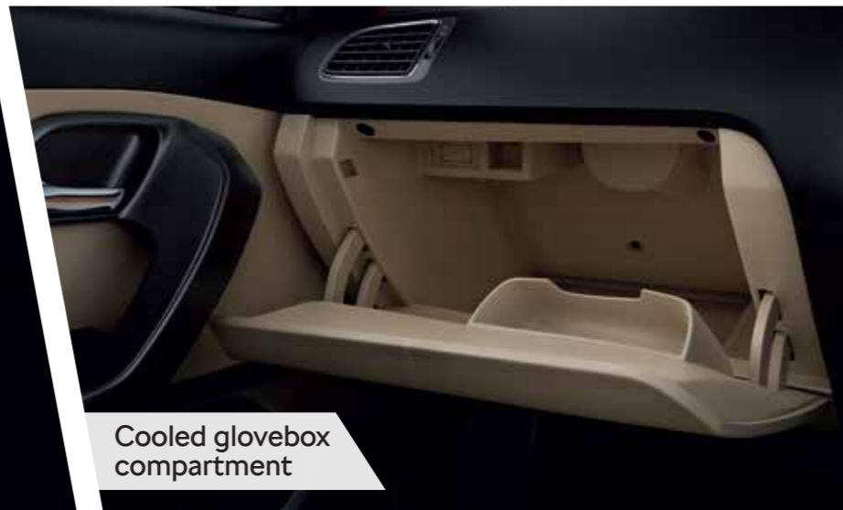
Cooled glovebox compartment