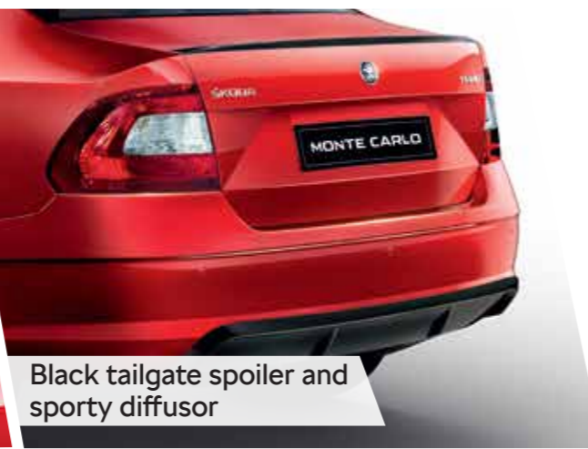
Black tailgate spoiler and sporty diffuser