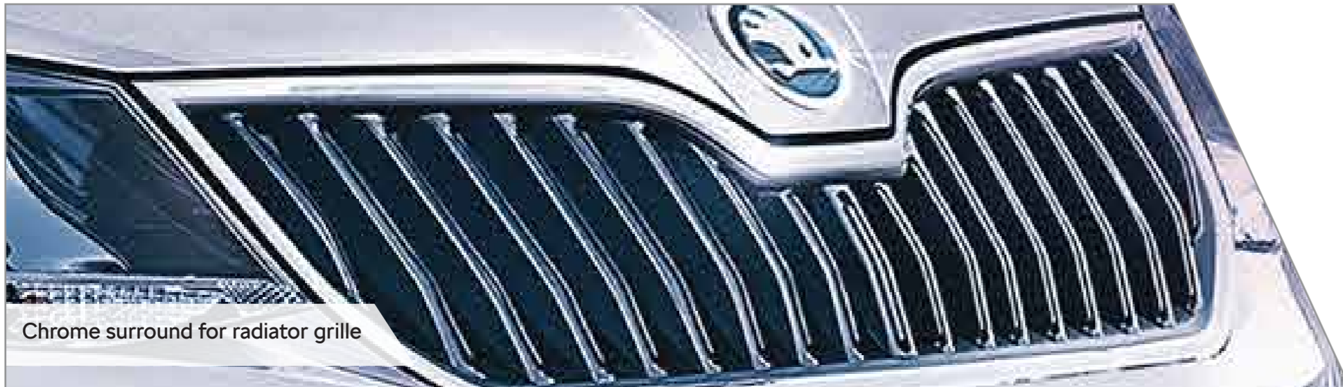
Chrome surround for radiator grille