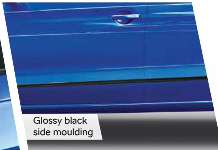
Glossy black side moulding