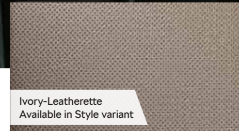
Ivory-Leatherette Available in Style variant