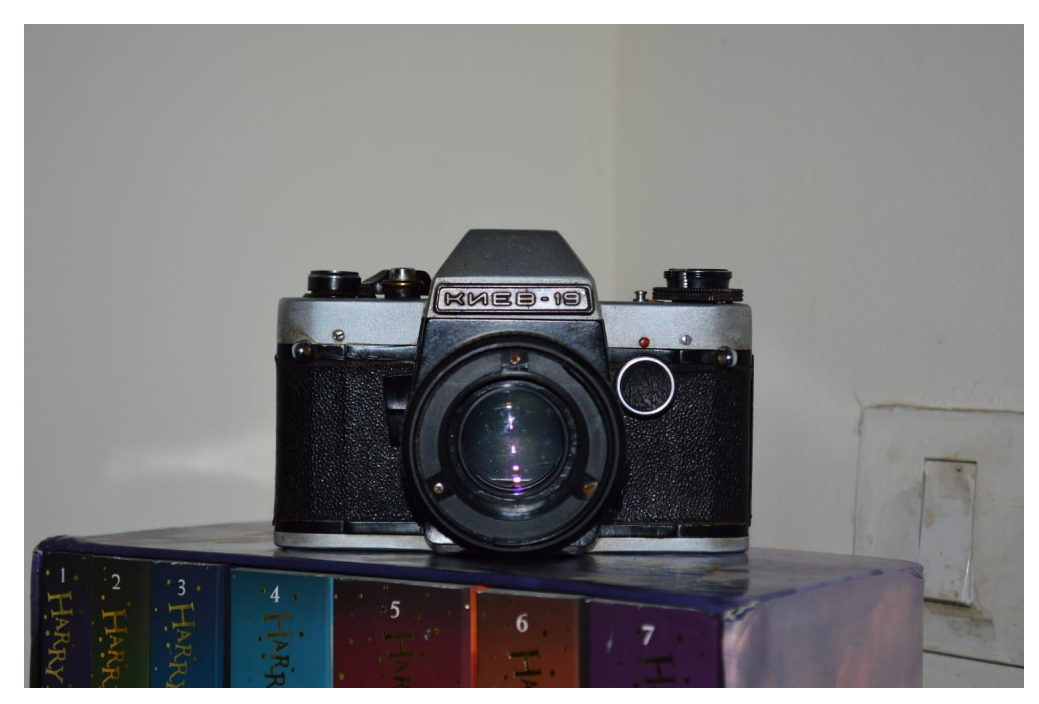
Kiev 19 SLR 35MM Film Roll Made in Ukraine(former USSR) 1985