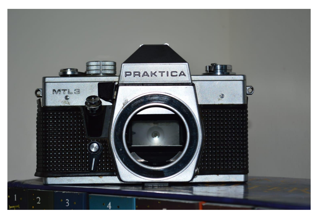
Praktica MTL3 SLR 35MM Film Roll Made in East Germany(GDR) - 1978