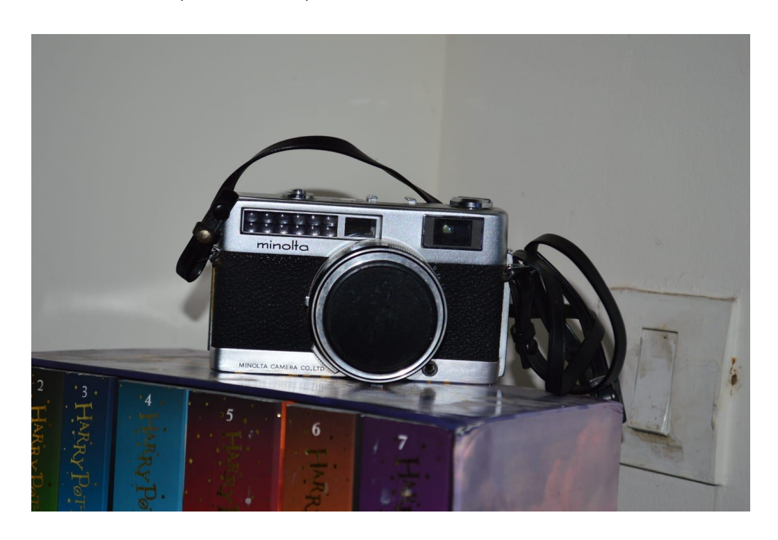
Minolta Minoltina AL-S and MC Rokkor Lens Compact Rangefinder - 35MM Film Roll Made in Japan 1964