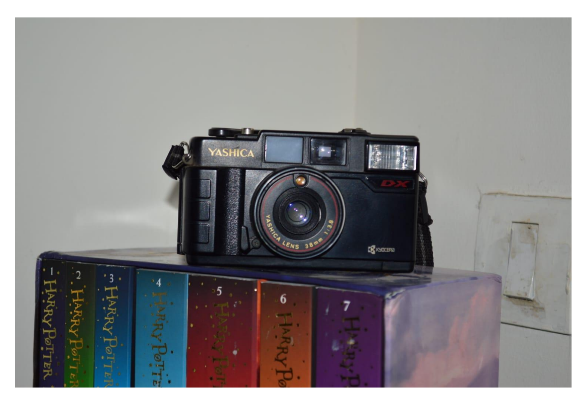
Yashica MF2 Super DX Point and Shoot 35mm film roll Made in Japan 1990