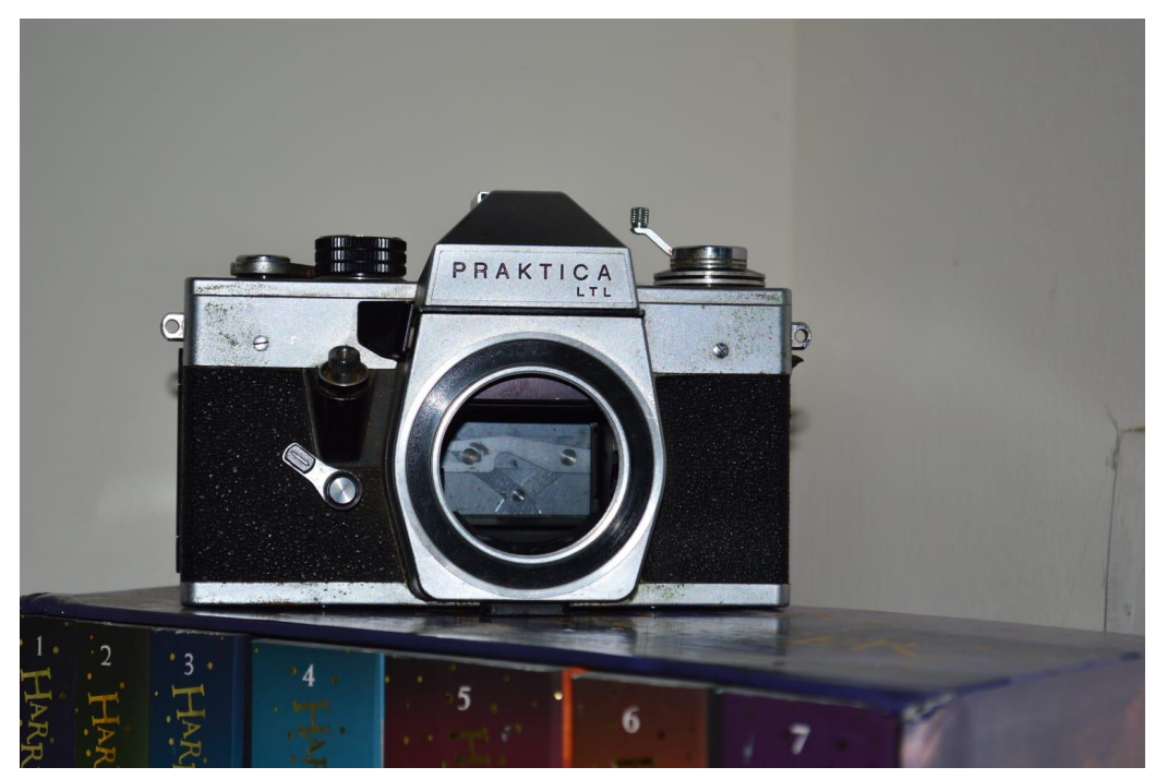
Praktica LTL SLR 35MM Film Roll Made in East Germany(GDR) - 1970