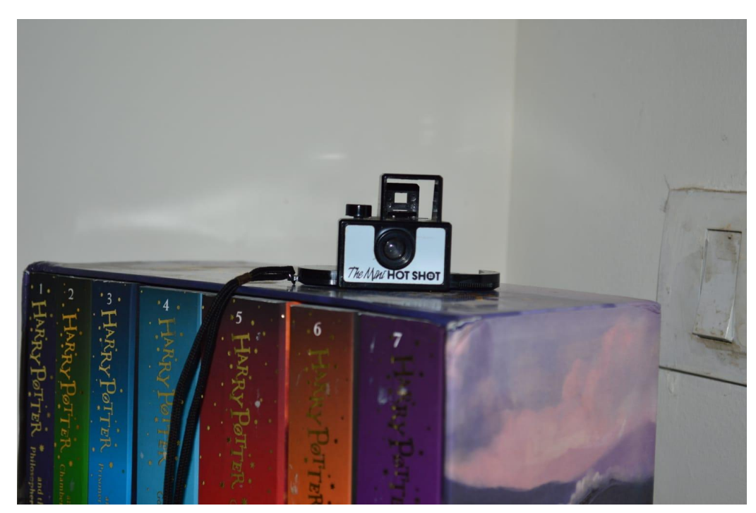
Mini Hotshot(Smallest film cameras) Point and Shoot 110 film roll Made in India(Goa) by Photophone Ltd