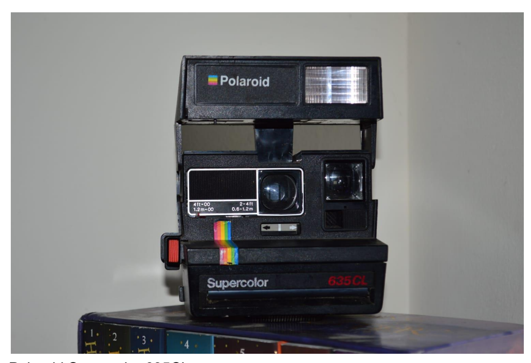
Polaroid Supercolor 635CL Instant Camera - 600 Polaroid FIlm Made in USA 1992