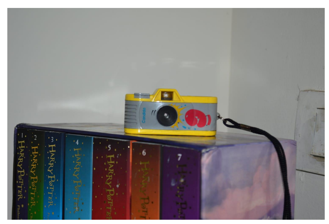
Candida(Kid's film cameras) Point and Shoot 110 film roll Made in Japan