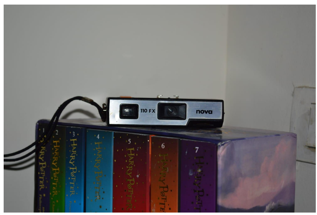
Nova 110FX Point and Shoot 110 film roll Made in SG 1980s