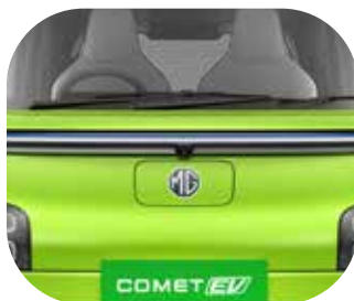
► EXTENDED HORIZON FRONT & REAR CONNECTING LIGHTS