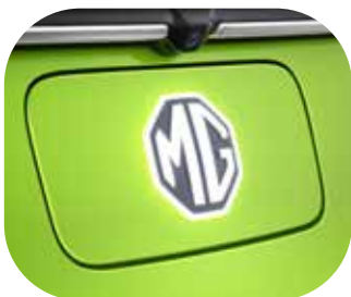
► ILLUMINATED MG LOGO

The futuristic motif of this car brings you a smart, sleek look with the 2-door design. Because we believe that your car should only bring you things that spark joy. Quite like the logo that illuminates every time you open the door of the car.