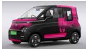
► NIGHT CAFE