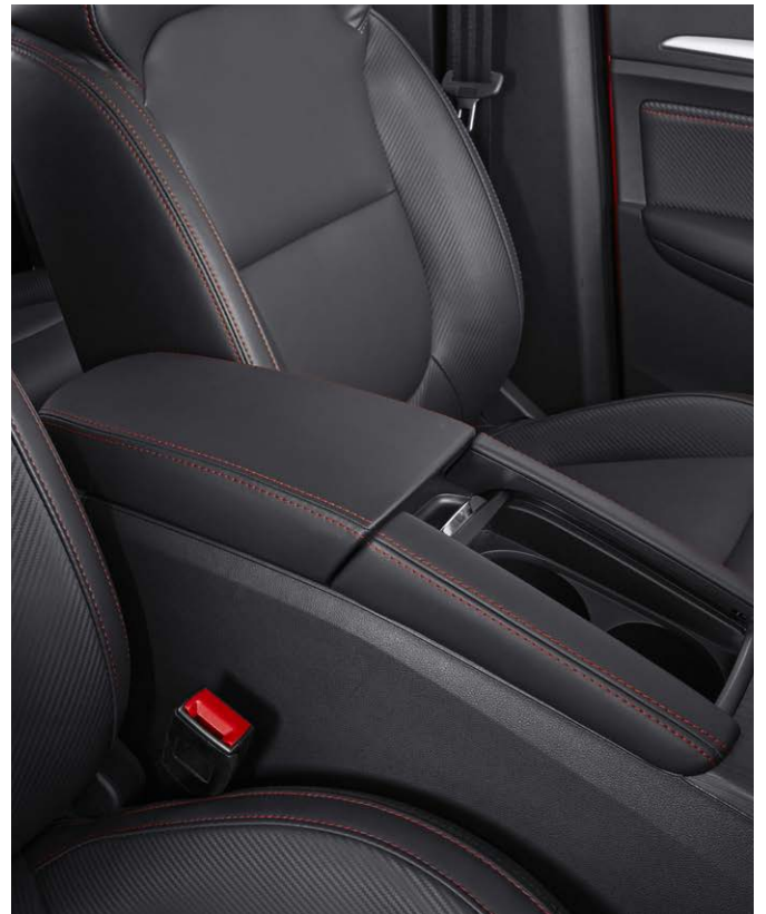
DRIVER ARMREST WITH STORAGE FUNCTION