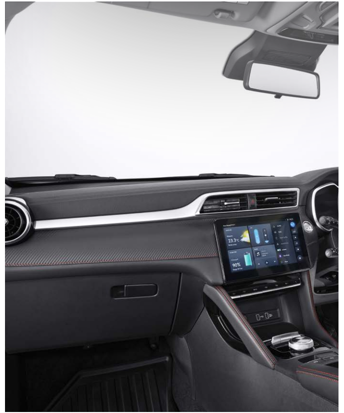
PREMIUM INTERIORS WITH LEATHER* LAYERED DASHBOARD