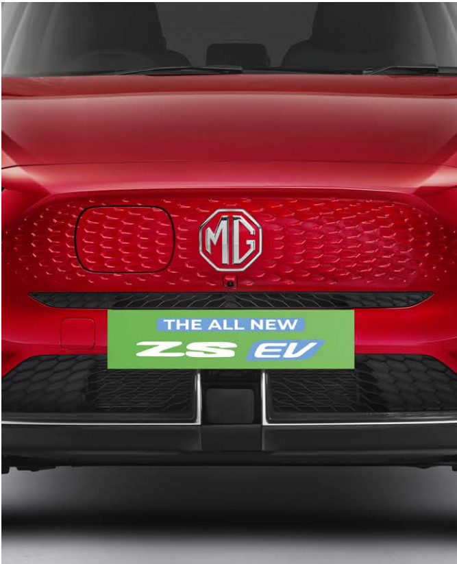
NEW ELECTRIC GRILLE DESIGN