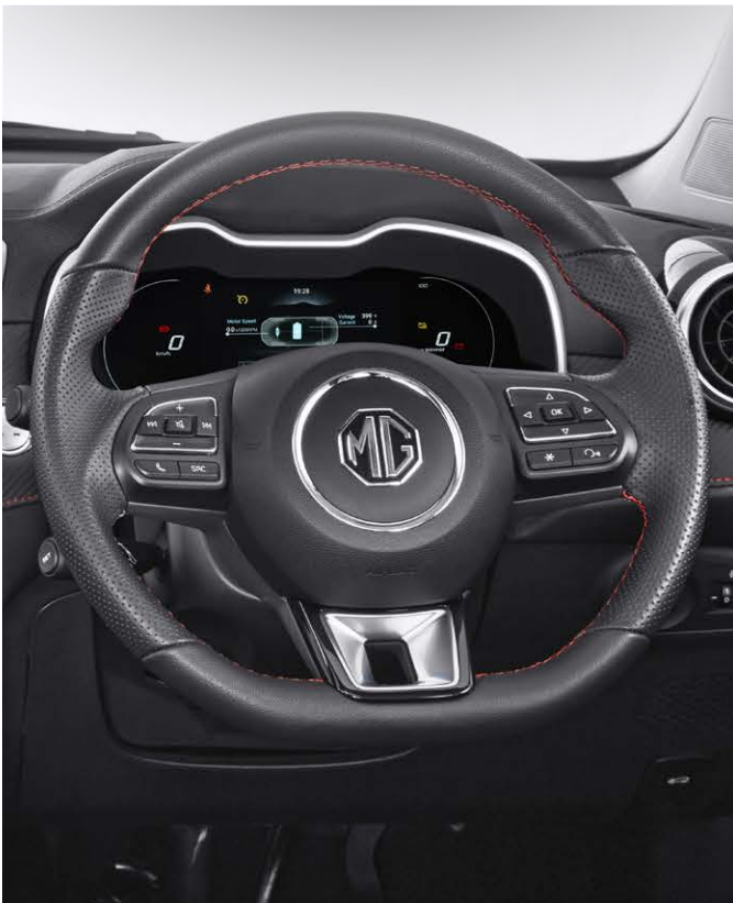
LEATHER WRAPPED STEERING WHEEL WITH RED STITCHING