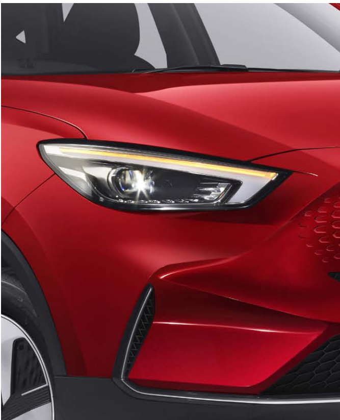
FULL LED HAWKEYE HEADLAMPS