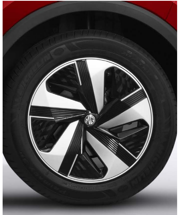
R17 TOMAHAWK HUB DESIGN ALLOY WHEELS