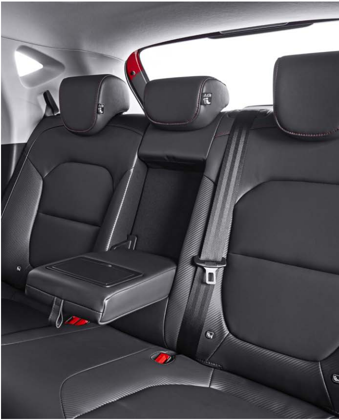
REAR SEAT COMFORT - REAR CENTER ARMREST, HEADREST & AC VENTS